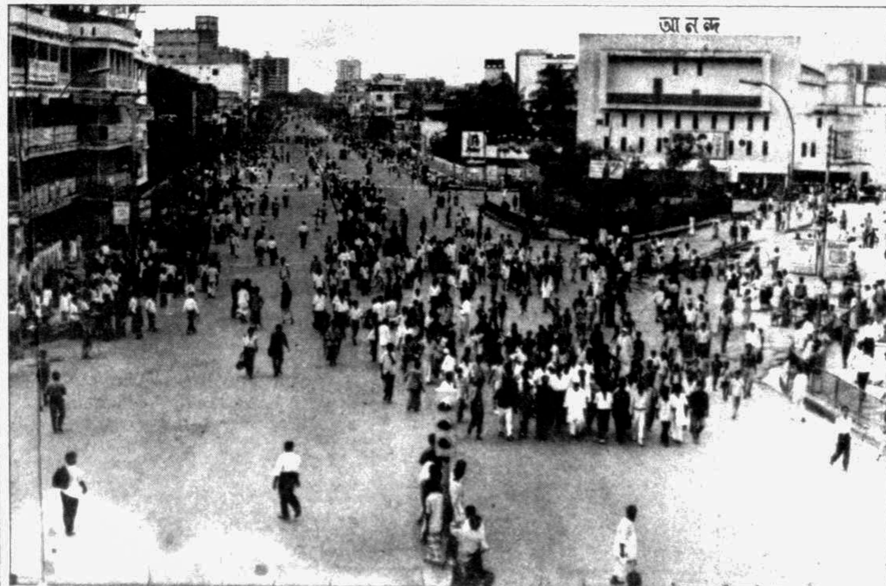
View of a city road during hartal hours yesterday.

Trawlers, launches and rescue boats have been sent to islands and coastal areas of See Page 12 Col 8