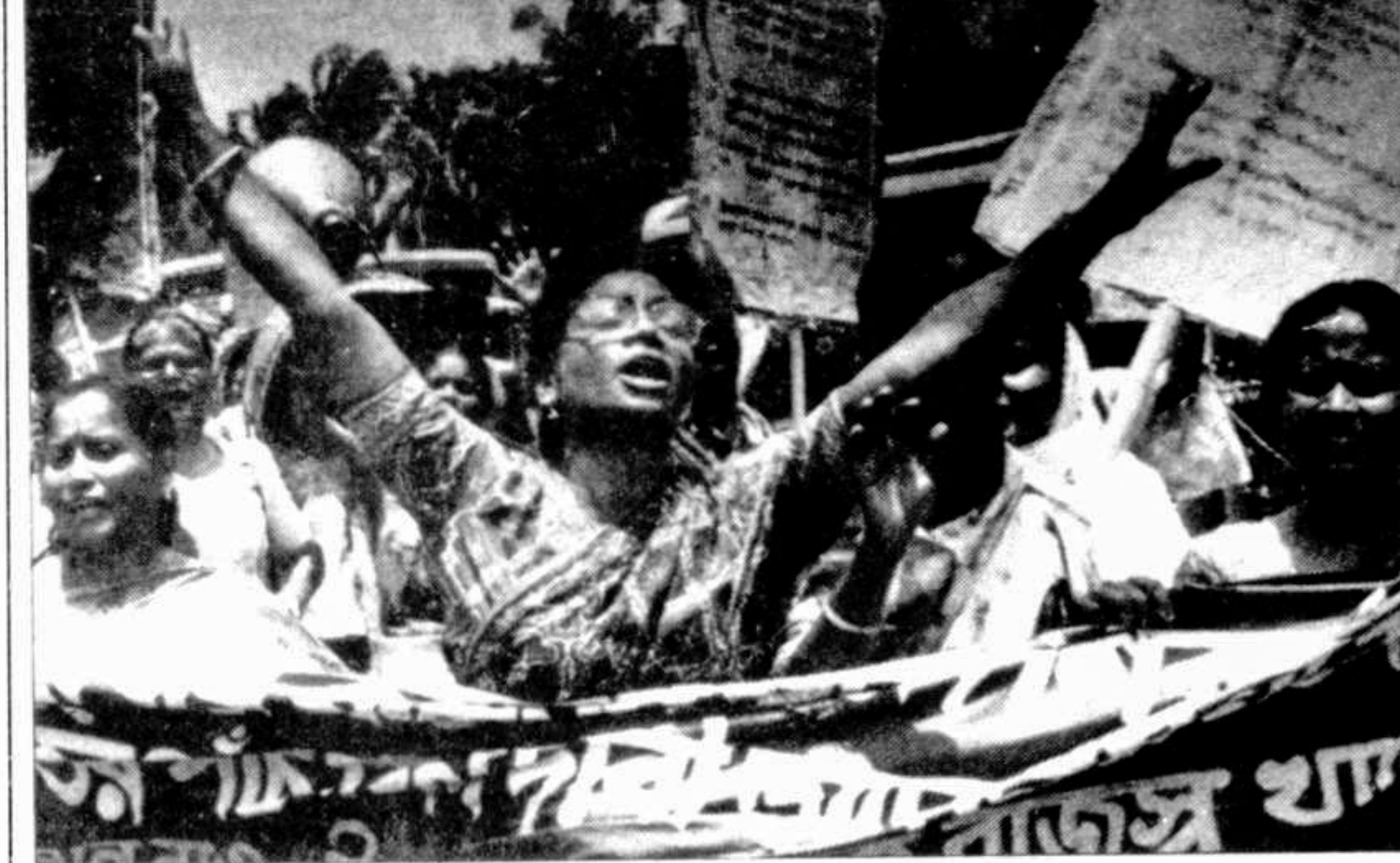
Members of Bangladesh Senior Family Welfare Visitors' Association brought out a procession in the city yesterday to press for their five points demand.