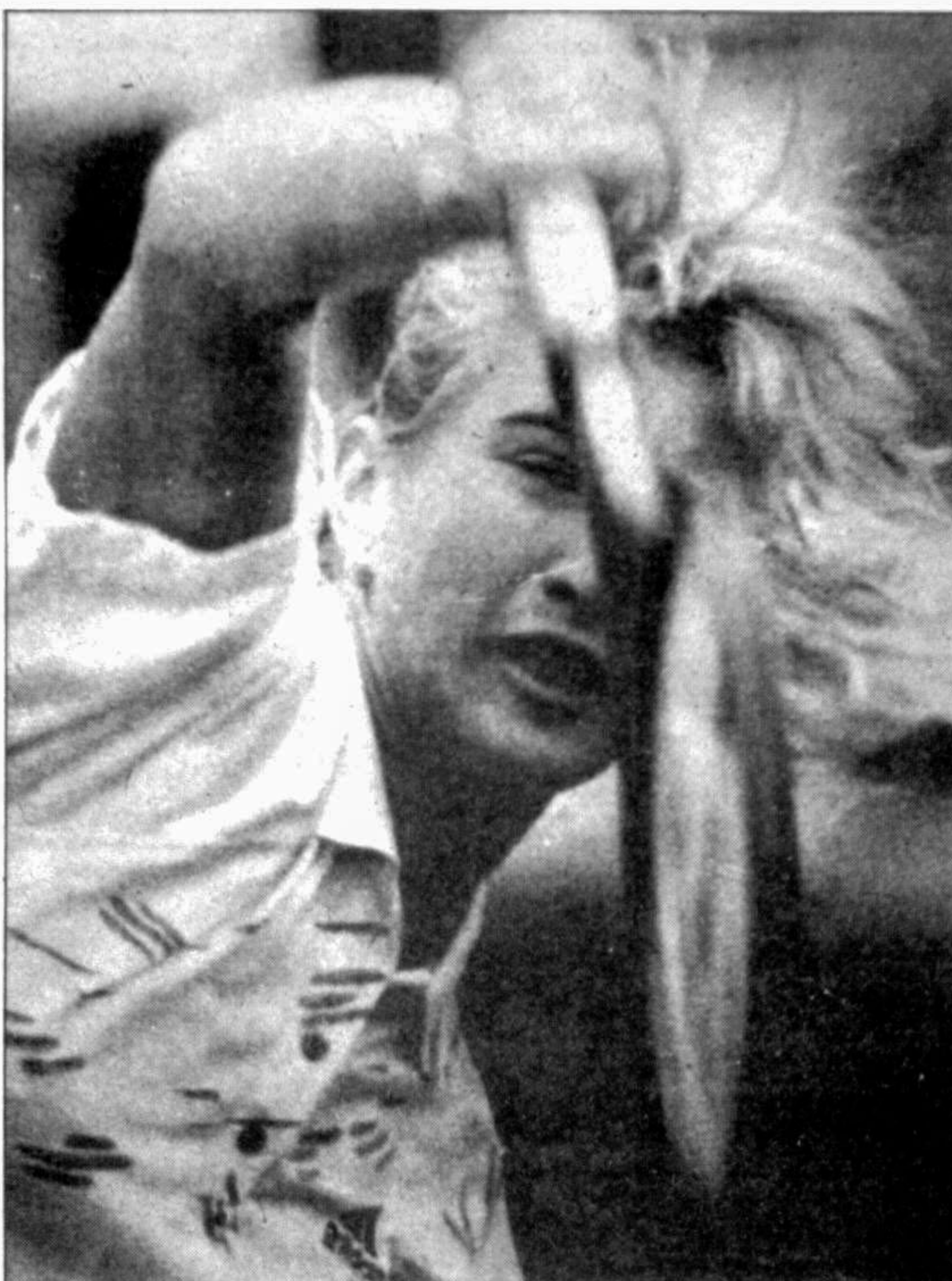
German Steffi Graf in action against American Jennifer Capriati during the semifinal match of the German Open tennis tournament in Berlin on May 16. Graf won 2-6, 6-3 and 6-4. World No.2 Graf went on to win the title beating Spaniard Arantxa Sanchez-Vicario 4-6, 7-6, 6-2 in the two-hour final Sunday, according to BBC monitored last night

Despite their victory over Eintracht, Hasna were relegated after their first season in the United Bundesliga.