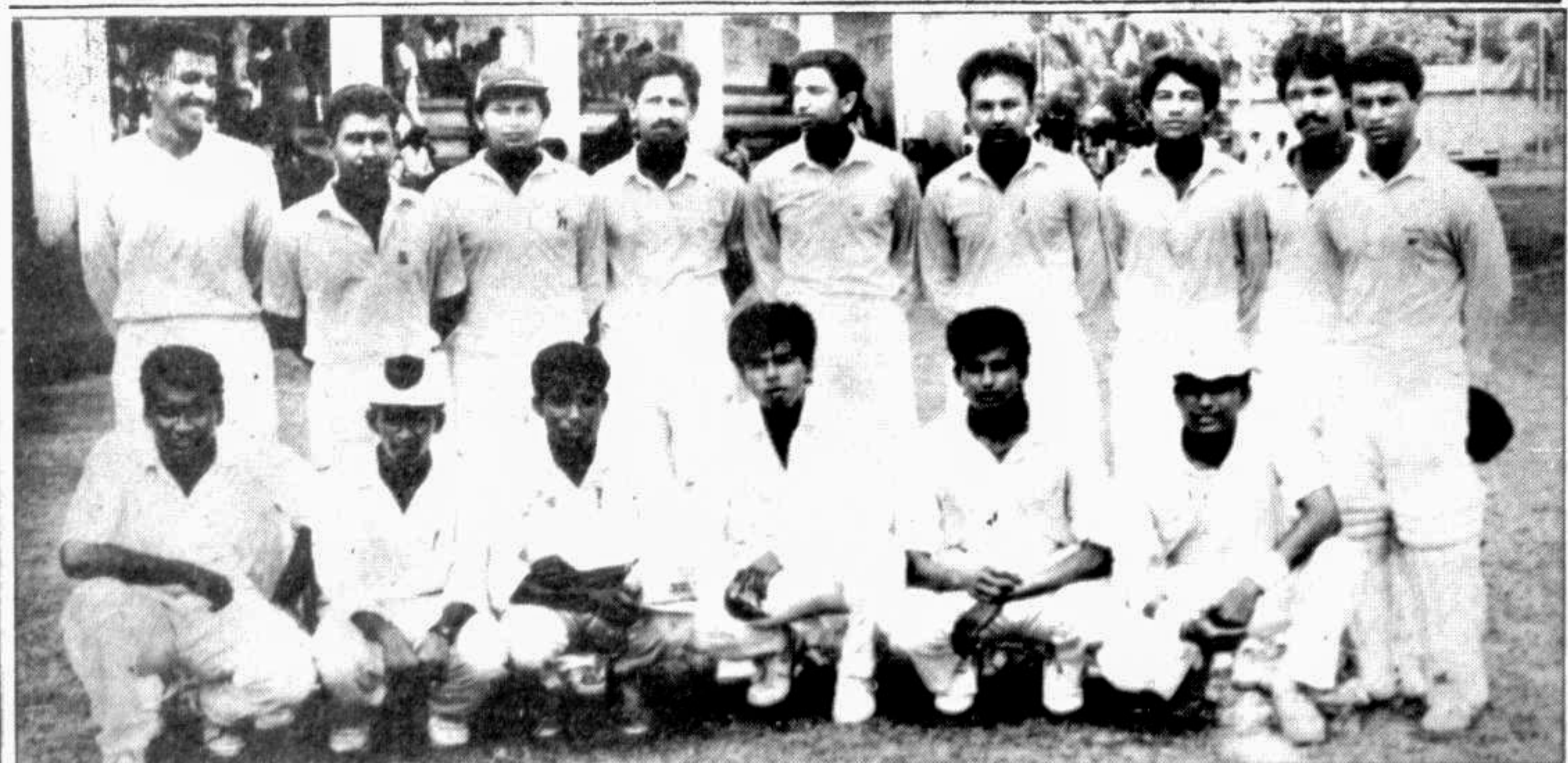
Department of Finance who retained the DU inter-department cricket championship by beating International Relations in the final yesterday at the Jagannath Hall ground.