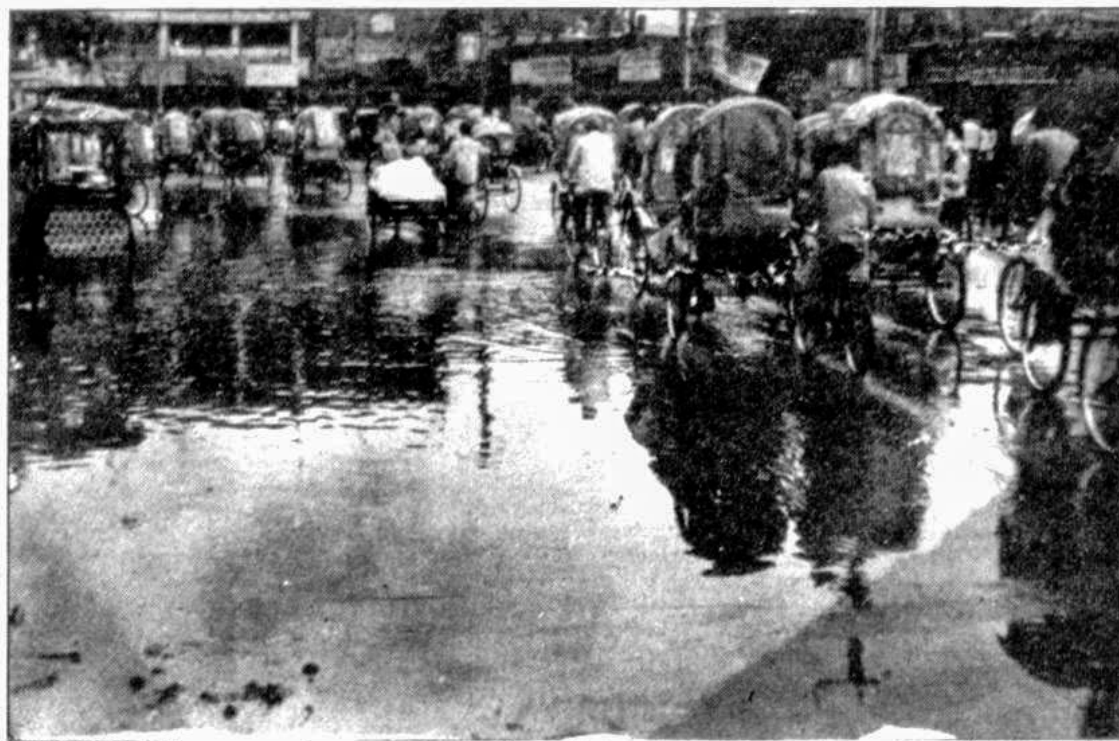
SYLHET Like some other areas, the Court-Point Area goes under water after a slight rainfall for which the town dwellers suffer much.

Local people and shop owners have demanded early development and proper maintenance of the markets.