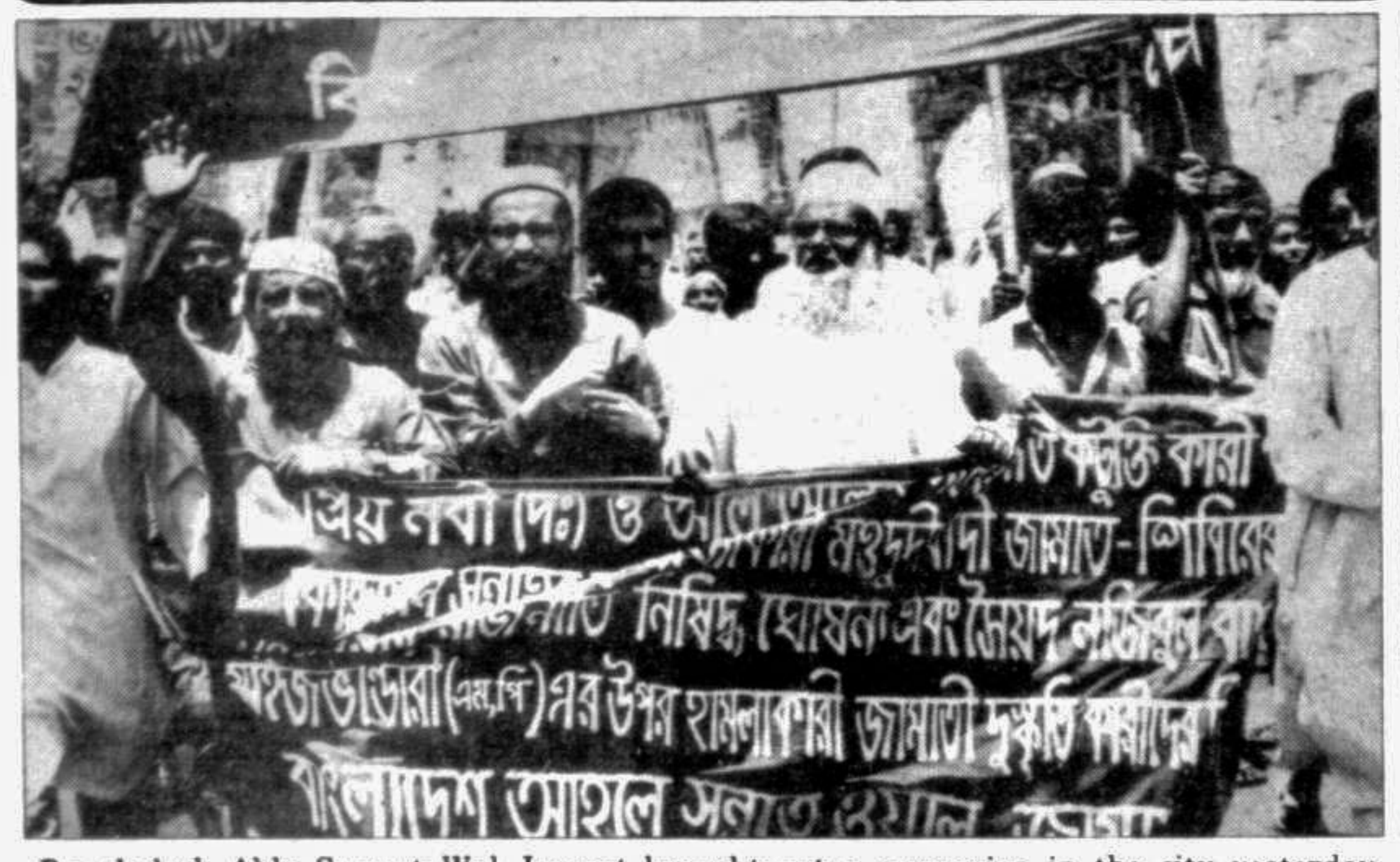
Bangladesh Ahle Sunnat Wal Jamaat brought out a procession in the city yesterday demanding ban on Jamaat politics.