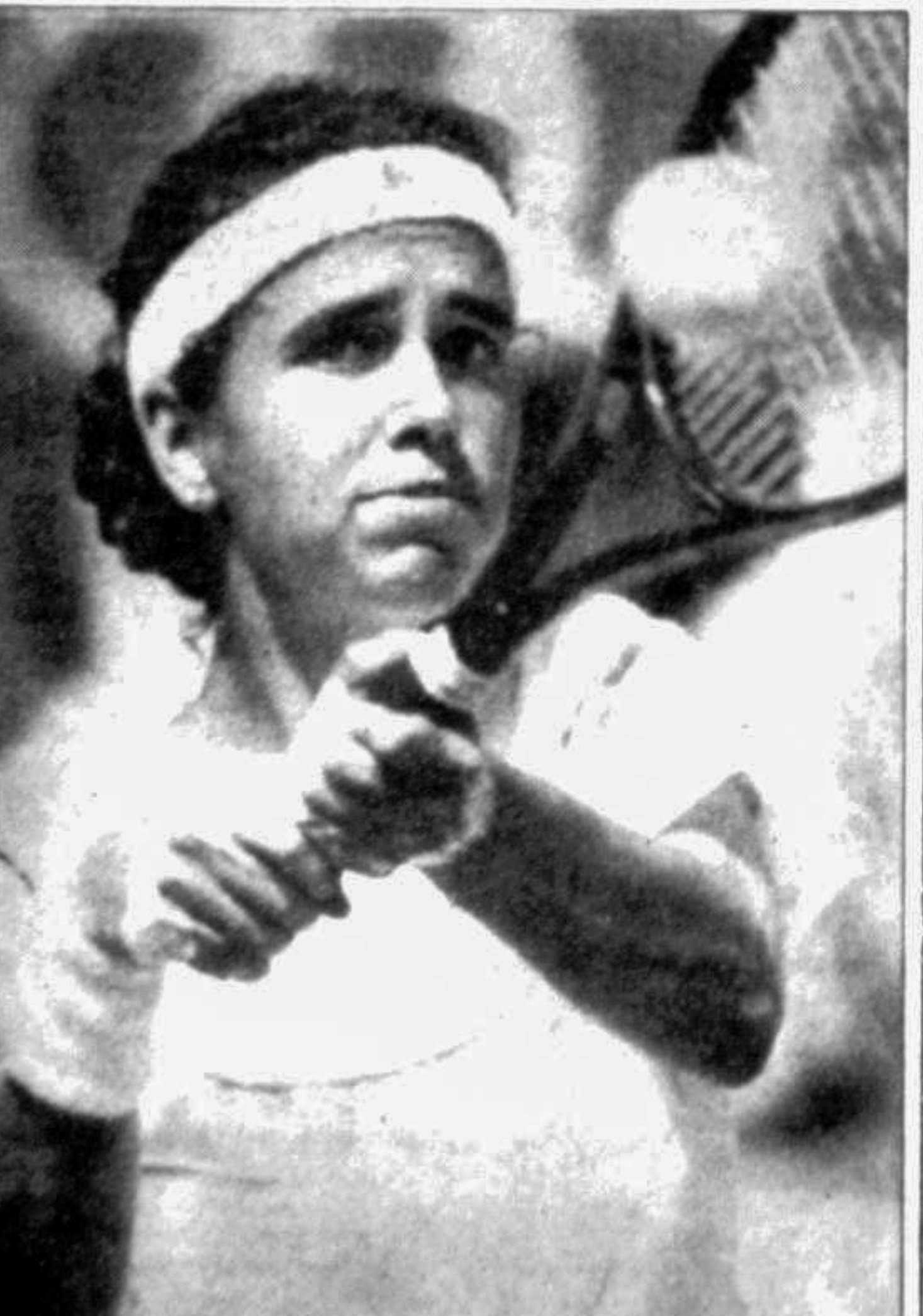
Mary Joe Fernandez of US in action to win the quarterfinal in the German Open women's tennis tournament against Italian Sandra Cecchini in Berlin on May 15. Fernandez defeated Cecchini 6-1, 7-6.

2-6 victory over France's Julie Halard. Halard did not help her cause by regularly playing the ball to Graf's strong forehand. All four top seeds sealed their places in the semifinals. Spanish second seed Arantxa Sanchez-Vicario beat Belgium's Sabine Appelmans 6-0, 6-3 and will meet American fourth seed Mary Joe Fernandez, a 6-1, 7-6 winner over Italian Sandra Cecchini.