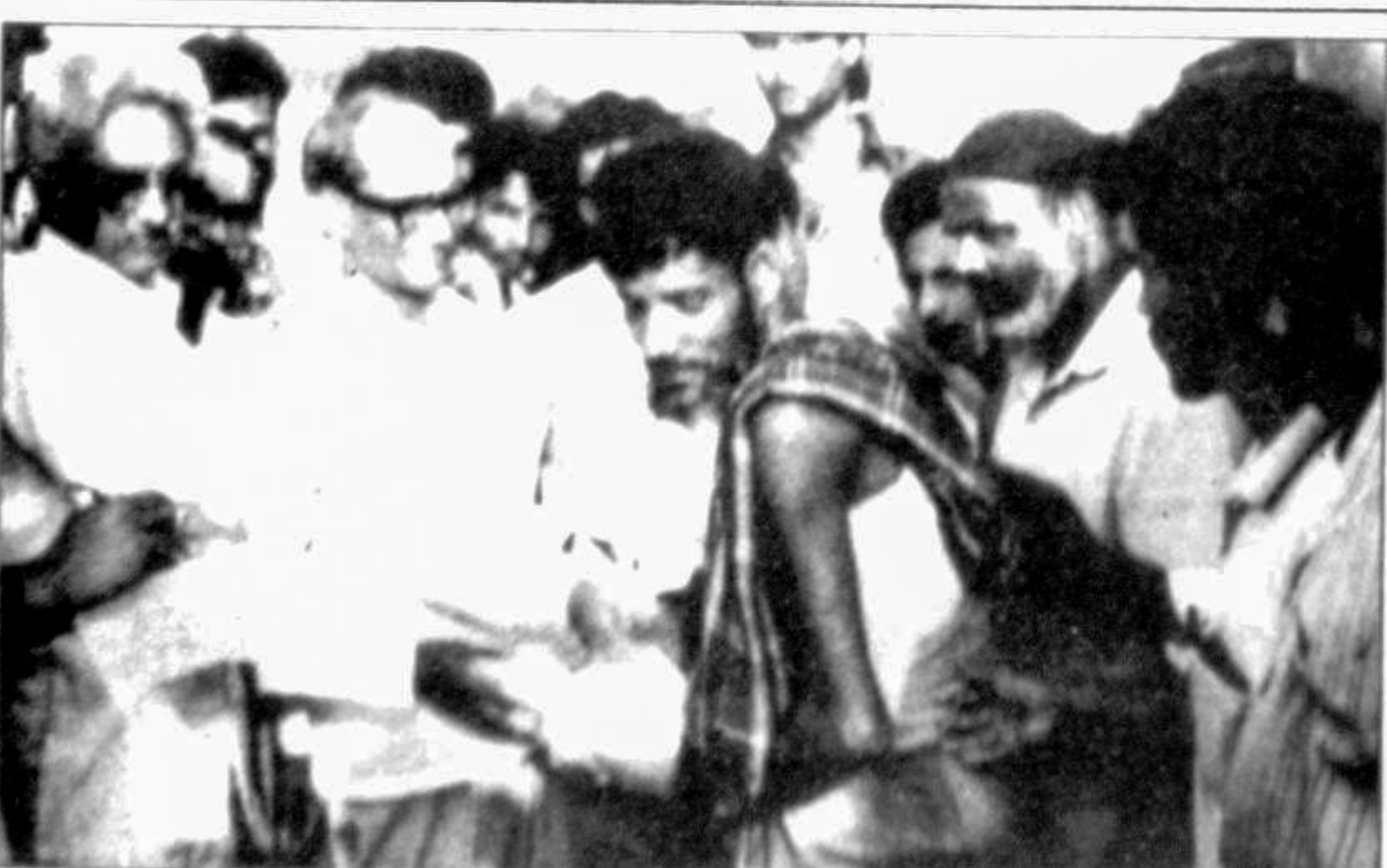
AGRI-VARSITY: Prof M Ashraf Ali, VC of BAU distributing relief materials to a tornado victim that swept over this area recently.

activities vitiating the serene atmosphere. Moreover, polygamies are also on rise causing disharmony in family life. The deep tubewell, sunk in the Mokamia Alla Madrasa premises here, has been lying inoperative for a long time causing difficulties to the students and the people of the adjoining area. The Mokamia Alla Madrasa, is an important Islamic education centre of the eastern region and there are about 700 students, Madrasa sources said. Besides, there is a big bazar, a Tahsil of office, bank, orphanage, dak-banglow, post office and primary school in the premises of the Madrasa, which used to get water from the tubewell. Local people urged the authorities to repair the deep tubewell at the earliest.