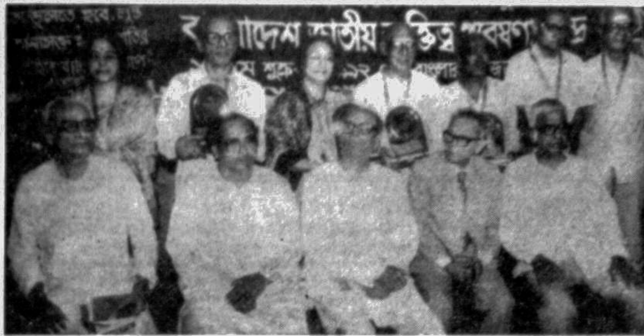
The National Personality Research Centre awarded Sher-e-Bangla Gold Medal to eight personalities of the country at a function held at the Mazar premises of A. K. Fazlul Haq and two other national leaders Friday.