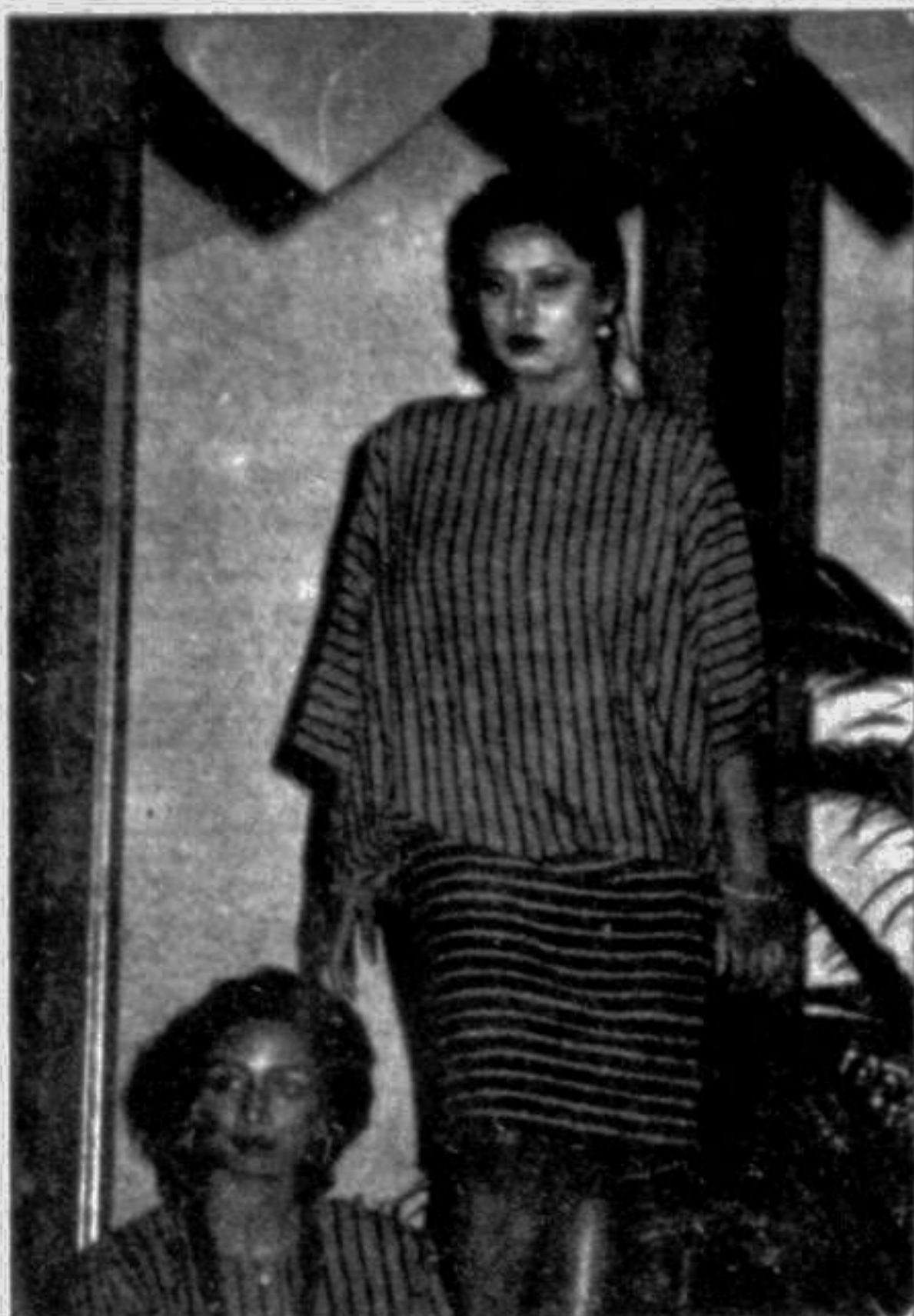
Modelling against social odds

Many developed countries of the world have promoted fashion and made it an art form. Creating fashion awareness has been limited to advertisements and window displays till now. Through fashion shows many organizations, specially the garment industries are playing significant roles in promoting the sale of our own products. To keep pace with the changing world of fashions the designers are blending Western trends. With increased demands for fashion shows, the models can aspire for successful careers provided they have the liberty to do so. Unless adequate freedom and opportunities are assured to aspiring models, the fashion shows will not improve or achieve their goals.