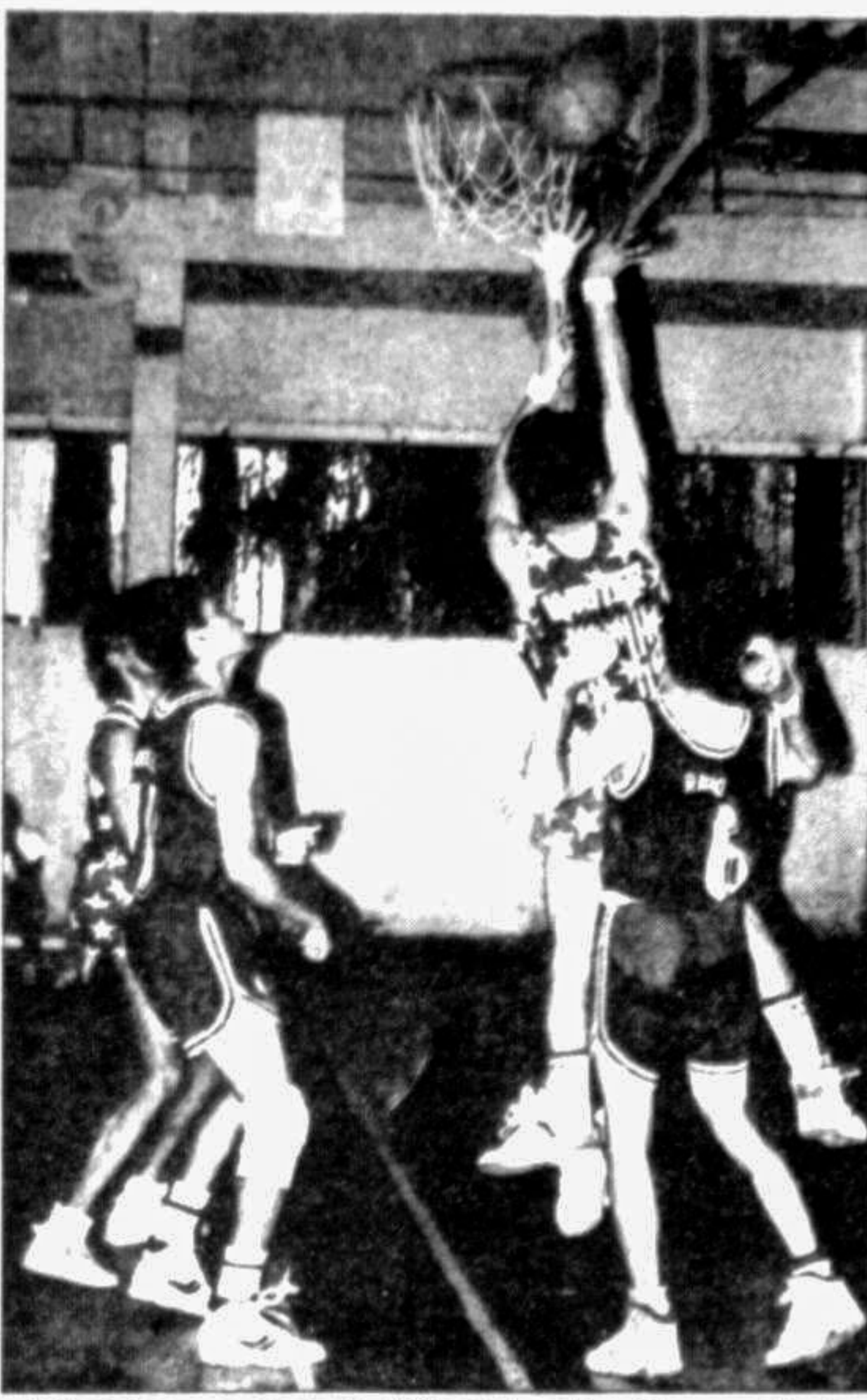
Action from yesterday's fifth Federation Cup semifinal between Five Star Club and Dhaka Winners at the wooden-floor gym.