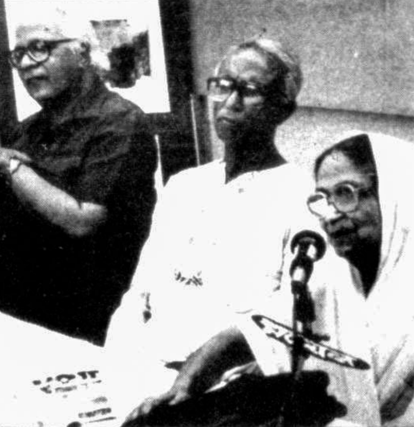
Poet Sufia Kamal addressing the inaugural ceremony of the art gallery Shilpangan in the city Thursday.