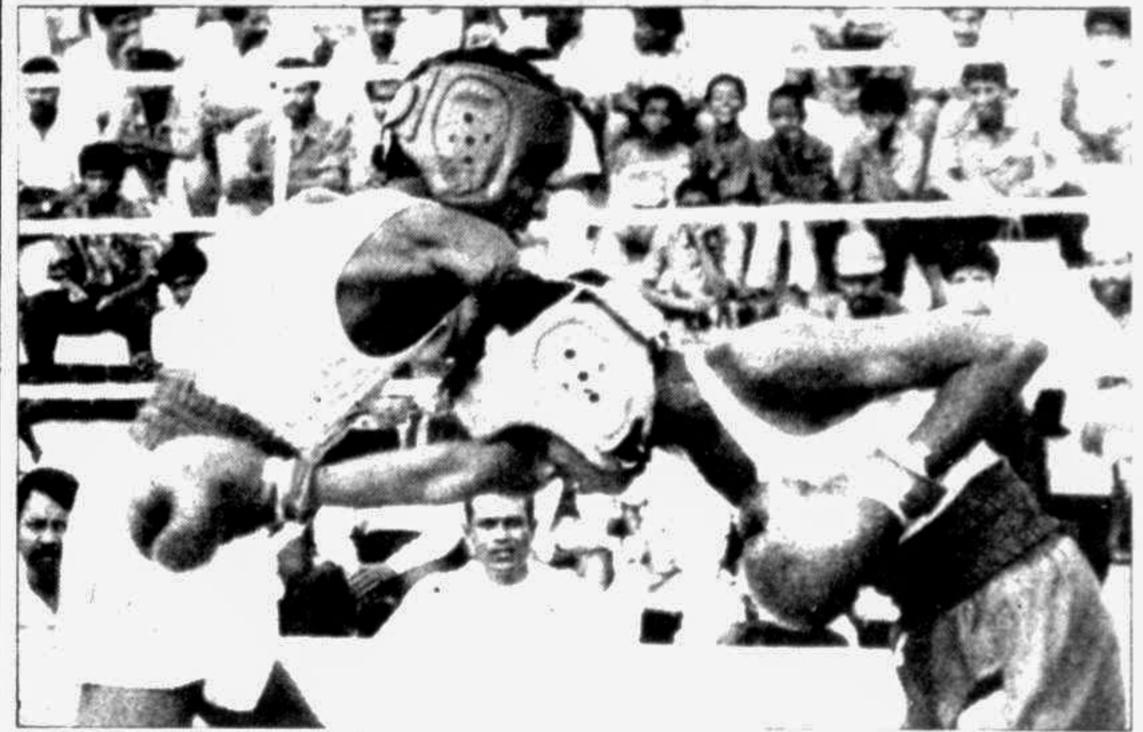
Action from yesterday's 11th national junior championships at the Muhammad Ali Boxing Stadium.

Bangladesh Jute Mills Corporation (BJMC) punchers reigned supreme in the ring yesterday, the second day of the five-day 11th national junior and second intermediate boxing championships at the Muhammad Ali Boxing Stadium.