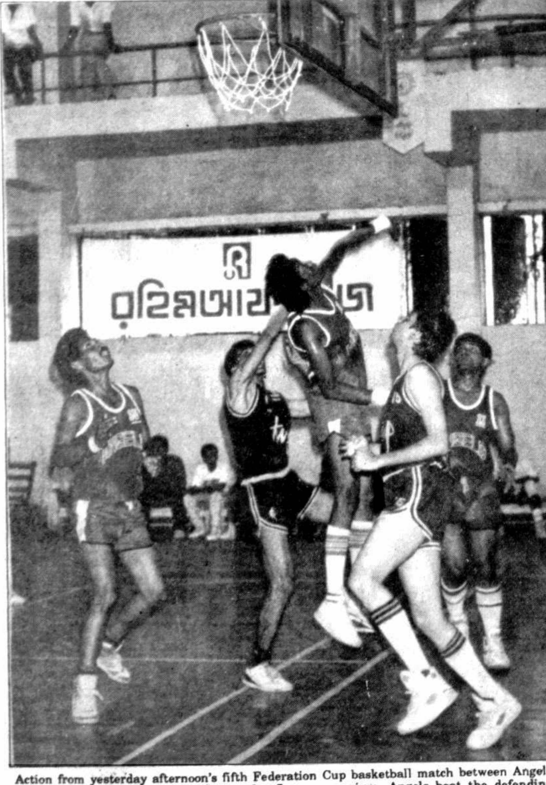
Action from yesterday afternoon's fifth Federation Cup basketball match between Angels Club and Dhaka Winners at the wooden-floor gymnasium. Angels beat the defending champions 97-47.

As eye-witnesses recalled, a couple of chaps, apparently with a view to intimidation, hurled two home-made 'cocktails' (or crackers) just before the start of the ill-fated Group A fixture between Five