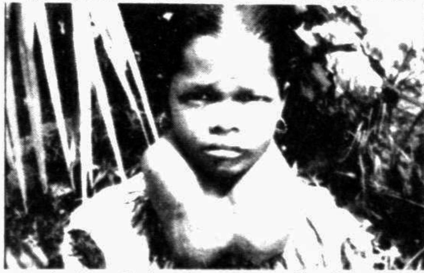
A goitre patient.

Farmers said a vast tract of land remained fallow for want of such expected rainfall.