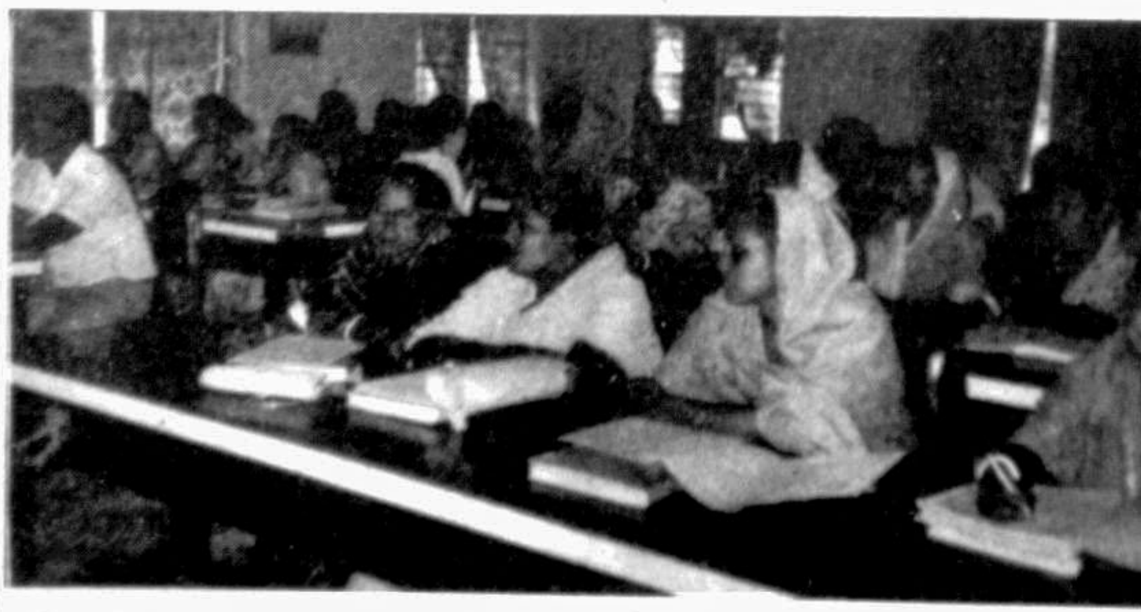
SYLHET: Participants at a workshop on family planning held here recently.

Sadhanar Sramik Karmachari Parishad of the mills gave the call for shutdown in the district town.