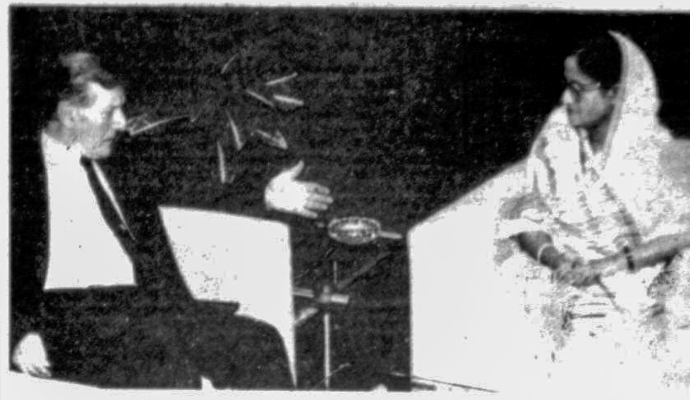
Lord Ennals, Chairman of the Asia Committee of the British Refugee Council called on Awami League Chief and Leader of the Opposition in Parliament Sheikh Hasina at her office Tuesday.