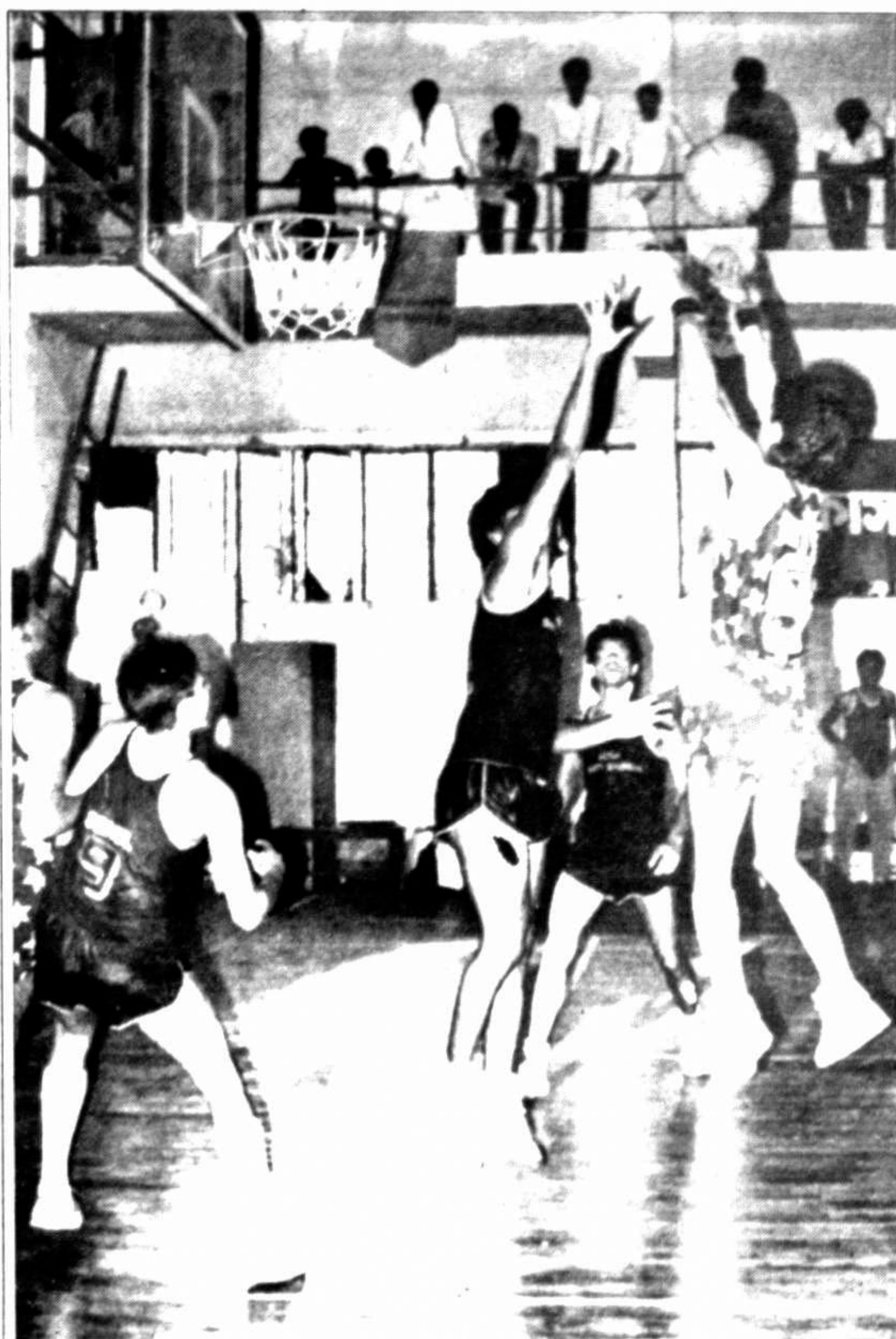
Action from yesterday's fifth Federation Cup basketball tourney Group A match between Five Star Club and Altaf Smriti Sangha of Rajshahi. The Dhaka side, sporting all those stars, won 117-48 at the wooden-floor gym.

Matches will be played at the various city cricket venues such as Dhaka Stadium, Dhanmondi Cricket Stadium, Dhanmondi Club ground, Mirpur Pallabi and the Mohakhali T & T ground.