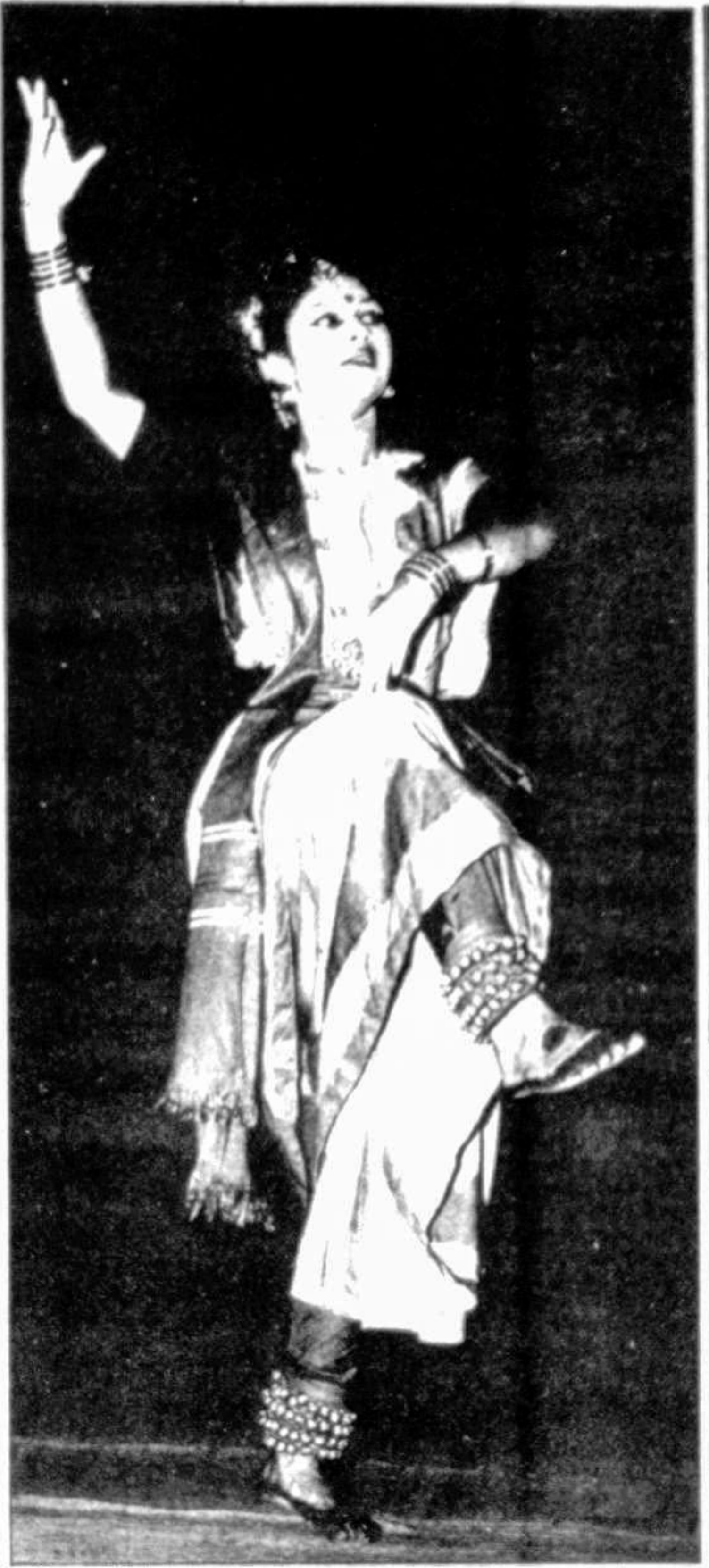
On Shishu Academy stage in the city yesterday a dancer in celebration of Rabindranath Tagore's birthday.

The local recruiting agency has in the meantime approached the Saudi embassy for taking up the matter with authorities concerned and requesting the reimbursement of the cost. No one from the Saudi embassy, however, was available for comment.