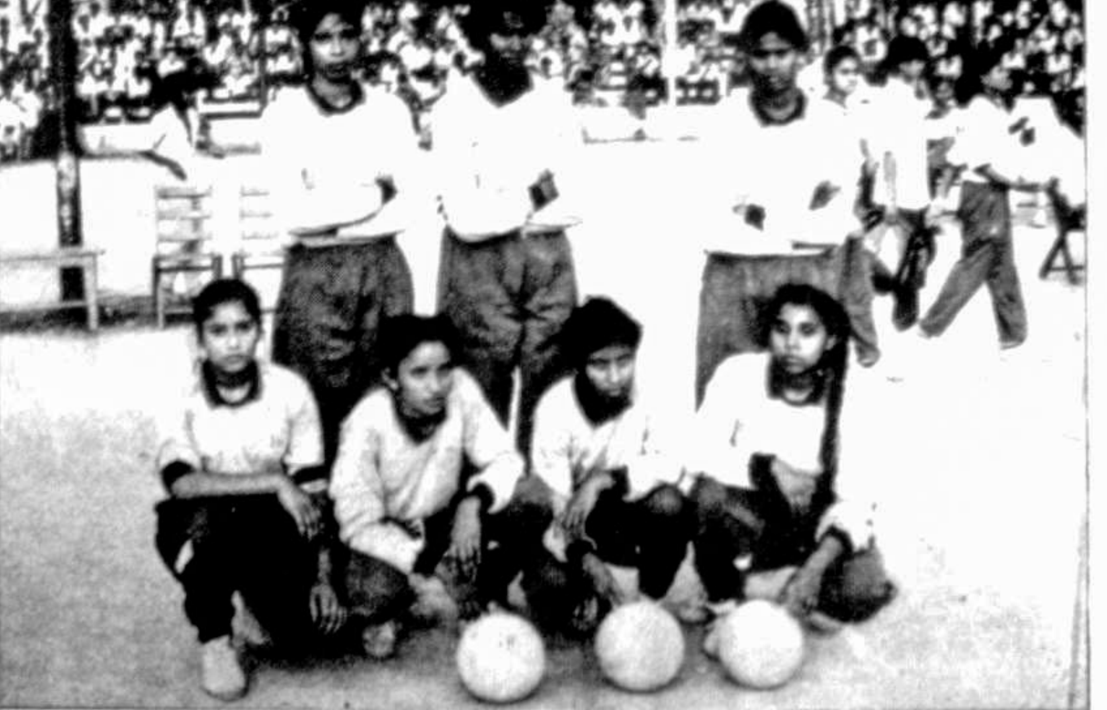
The triumphant Bangladesh Jute Mills Corporation girls who annexed the ninth national women's volleyball championship beating Rangpur in yesterday's final at the Outer Stadium volleyball court.

Sports Reporter Bangladesh Jute Mills Corporation are the new national women's volleyball champions. In the final of the ninth version of the nationals at the Outer Stadium volleyball court yesterday the spikers from BJMC beat Rangpur DSA by three sets to two in a thrilling contest despite the sultry heat and humidity. spiking of their BJMC opponents. The second set was slightly keener with Rangpur managing to take 12 points off their more fancied rivals. Just when everything seemed lost for the girls from the northern district of the country their fortunes suddenly turned with complacency creeping in among the players on the other side of