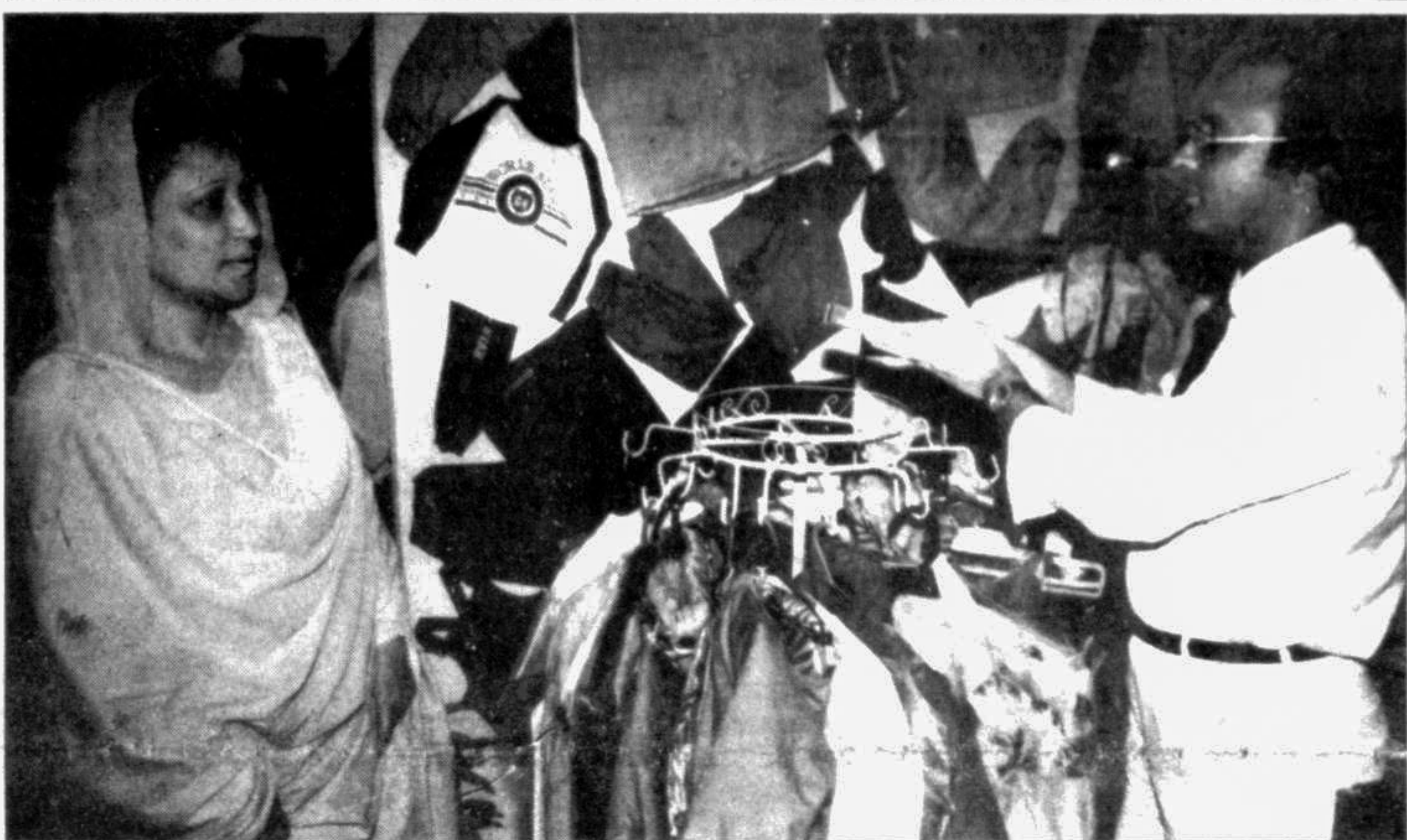
Prime Minister Begum Khaleda Zia visiting a stall at the apparel export exhibition at Sonargaon Hotel, yesterday.

The well-organised religious party, considered influential among urban middle class, has a strong youth wing deeply entrenched in universities and colleges.