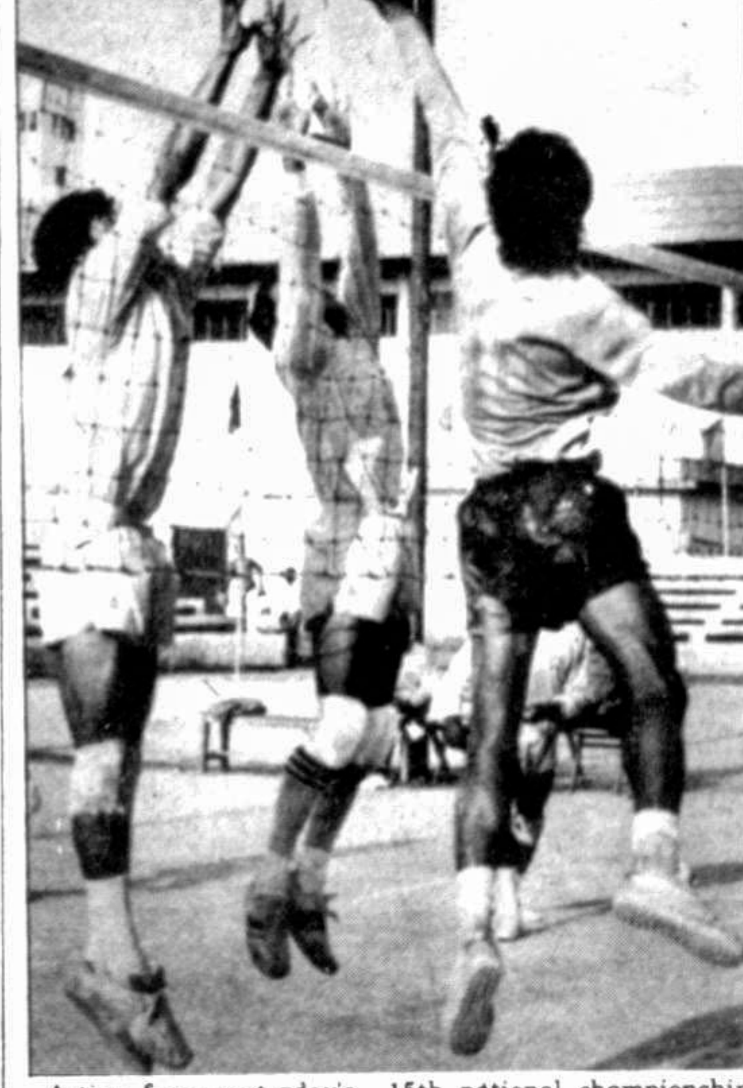
Action from yesterday's 15th national championship league match between Faridpur and Pabna at the Volleyball Stadium.

Defending champions Bangladesh Army marched inexorably on in their campaign to retain the national men's volleyball title, now being held at the Outer Stadium volleyball court in their last Group A league matches yesterday — one in the morning and one in the afternoon — the formidable Army spikers maintained their invincibility with fairly straight-forward wins, taking them to the top of the five-team cluster. Riflemen finding their prestige at stake, refused to give up without a fight. Pulling up their socks and playing for every thing they were worth, the BDR spikers injected fresh life into the match by squaring the score 2-2 in the next two sets 16-14 and 15-13, thus pushing the issue to a climactic fifth set. But the experienced soldiers, living up to their tag of champions, drew deep into their last reserves and thanks to the Riflemen running out of steam easily, almost too easily, clinched the issue 15-7 for a well-deserved triumph. Rifles play their last group game today against Comilla but look fairly assured of taking their place in the semifinals as Group A runner-up. Air Force are set to fill the last semifinal berth, notwithstanding the outcome of today's match against Navy. Thus, once again, the Services teams are poised to shut the rest of the participants out of the last four stage. Yesterday, Navy had only one match to play and that they won comfortably, outclassing Faridpur DSA 15-3, 15-3 and 15-1.