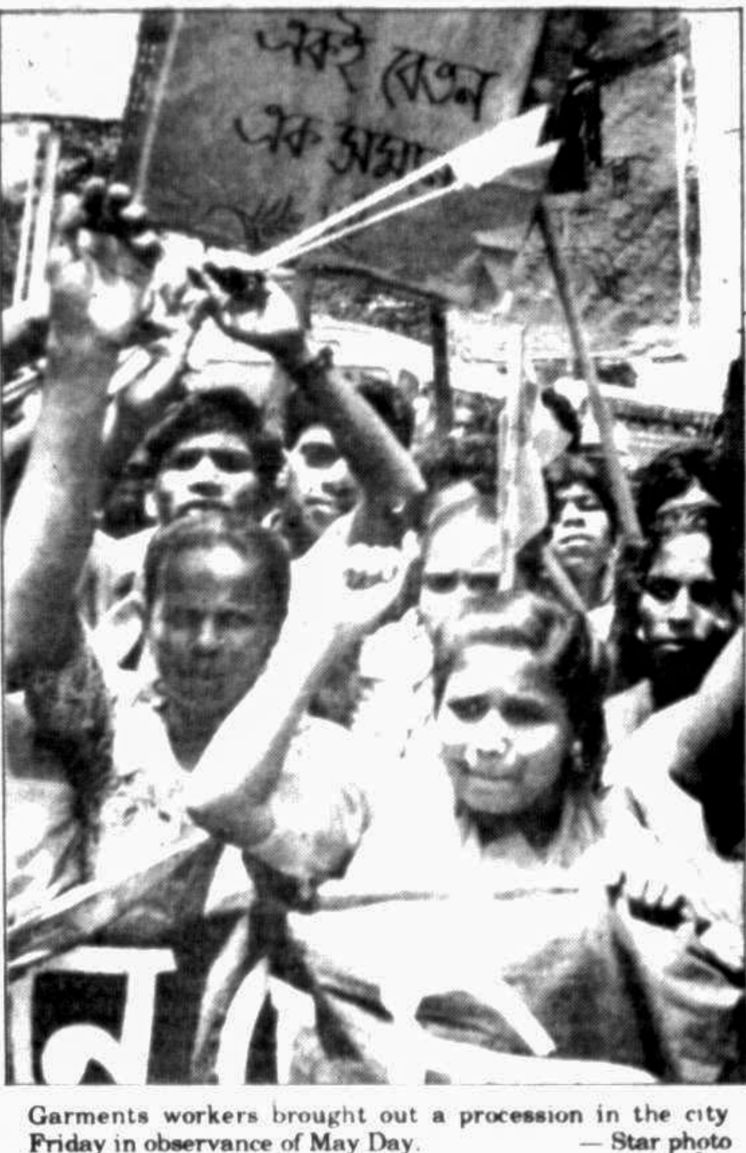
Garments workers brought out a procession in the city Friday in observance of May Day.