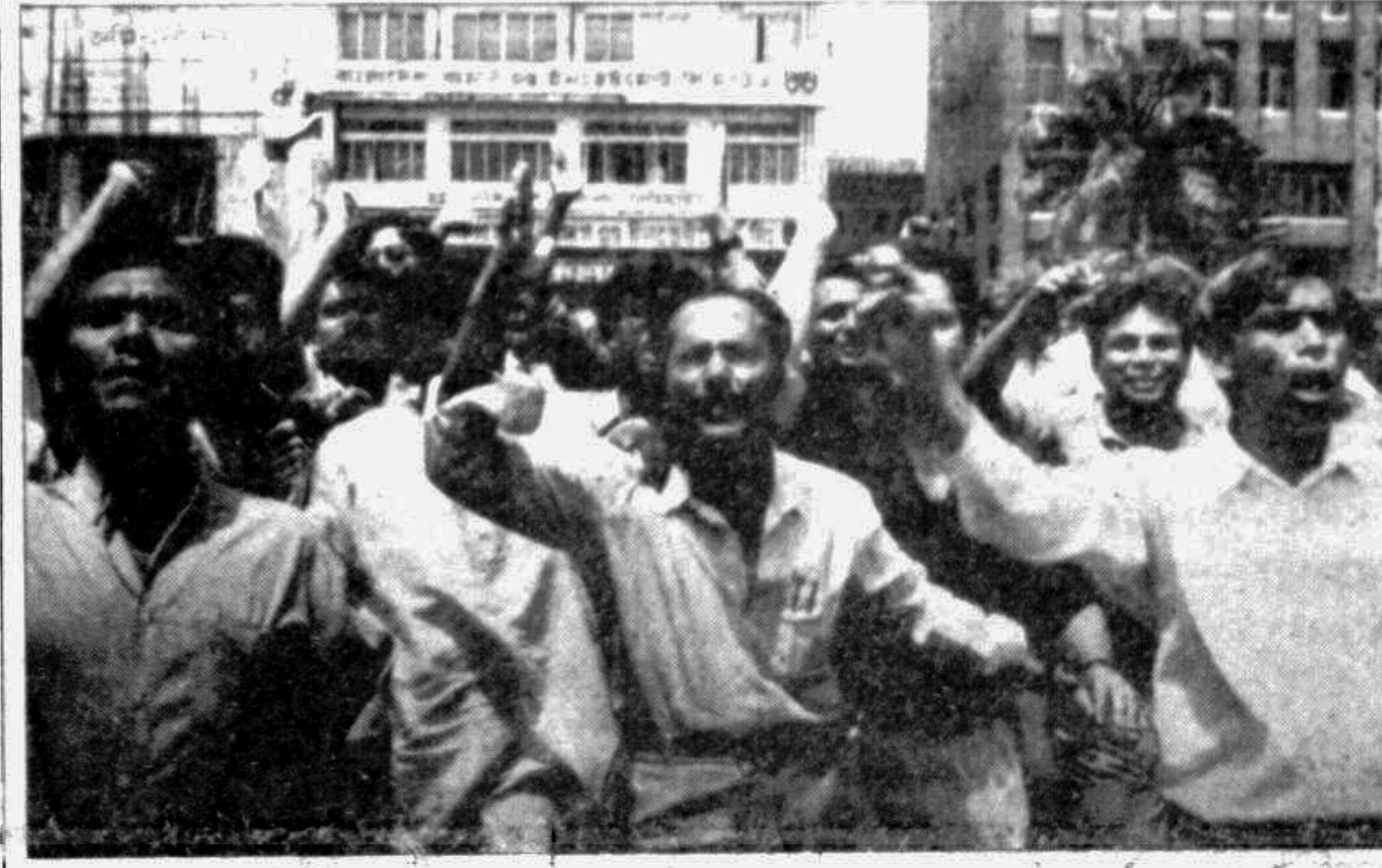
Depositors demonstrating in front of the BCI yesterday.

The Ministry of Finance has already advised the Bangladesh Bank to inquire into the activi- ties of NCL and examine possi- ble legal and financial implica- See Page 12 Col 2