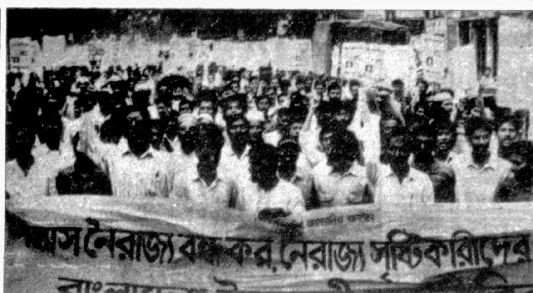
The activists of Bangladesh Islami Chhatra Shibir brought out a procession in the city Tuesday demanding punishment to terrorists.