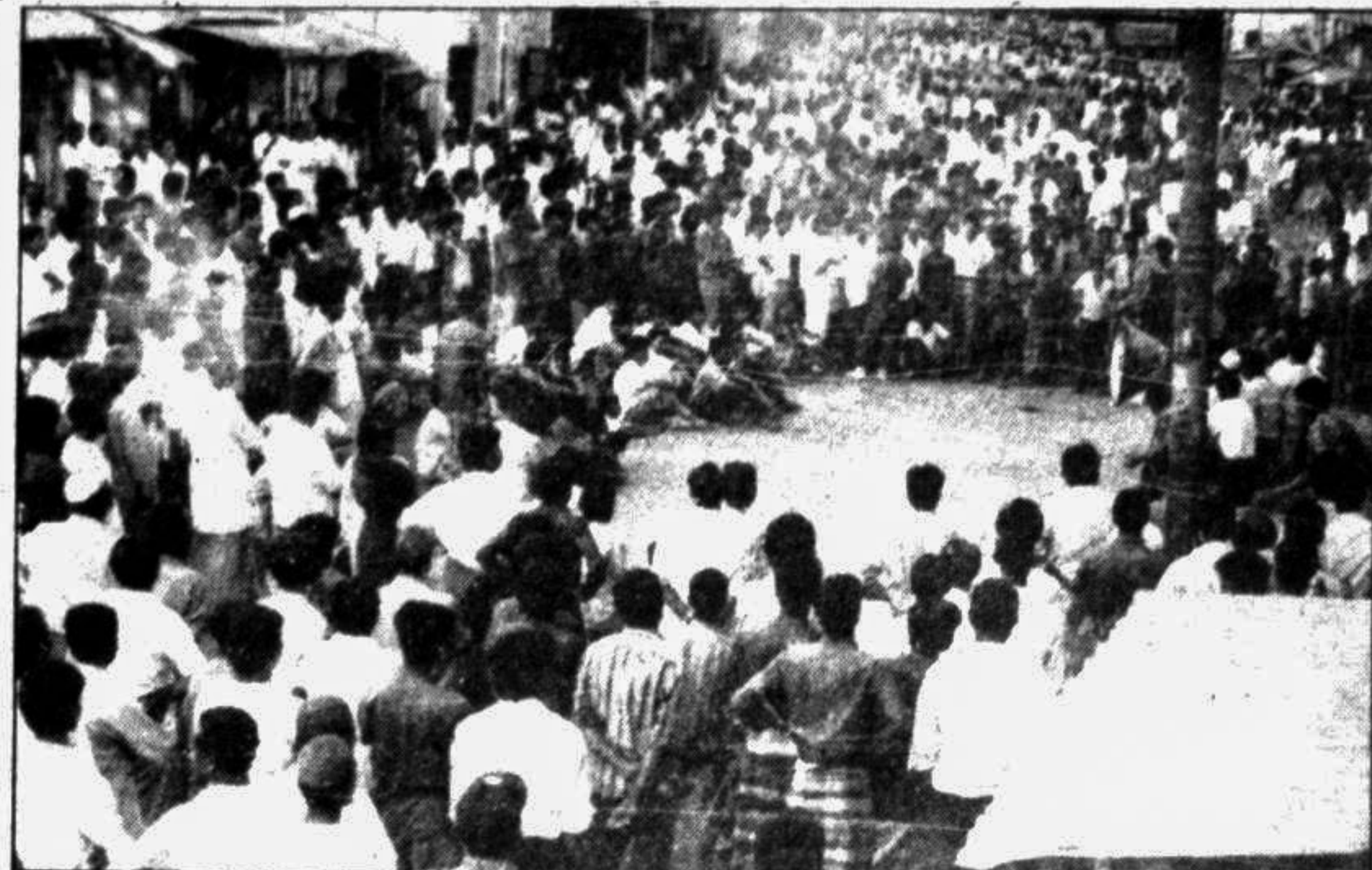
FARIDPUR: The local Ghatak Nirmul Committee recently organised a public meeting demanding execution of the judgement given by Gana Adalat.