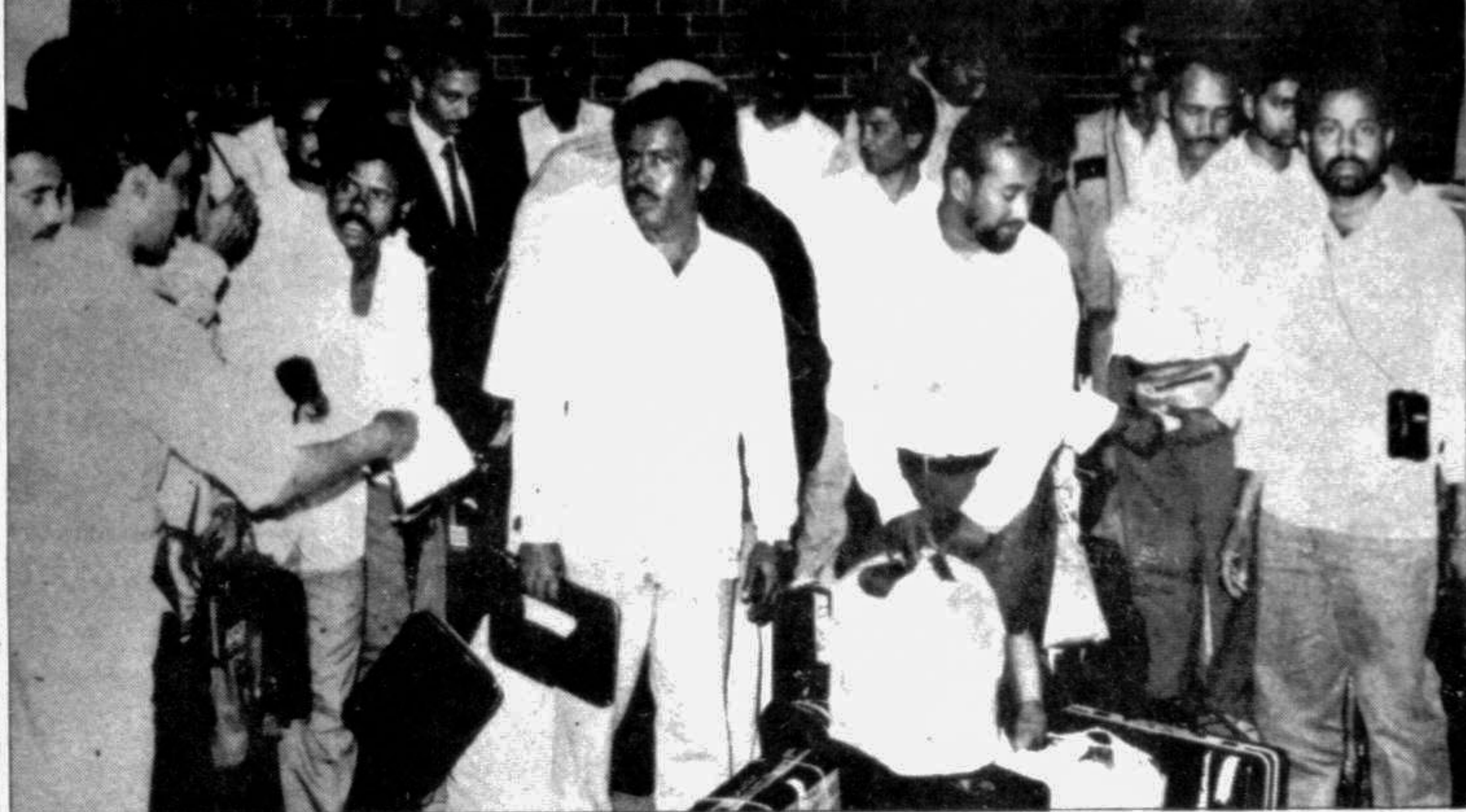
THE DECEIVED: A group of Bangladeshi workers arrived at Zia International Airport yesterday from Middle East. About 300 Bangladesh nationals provided with false documents by fake manpower recruiting agents are now ruing their gullibility in Abudhabi jails.