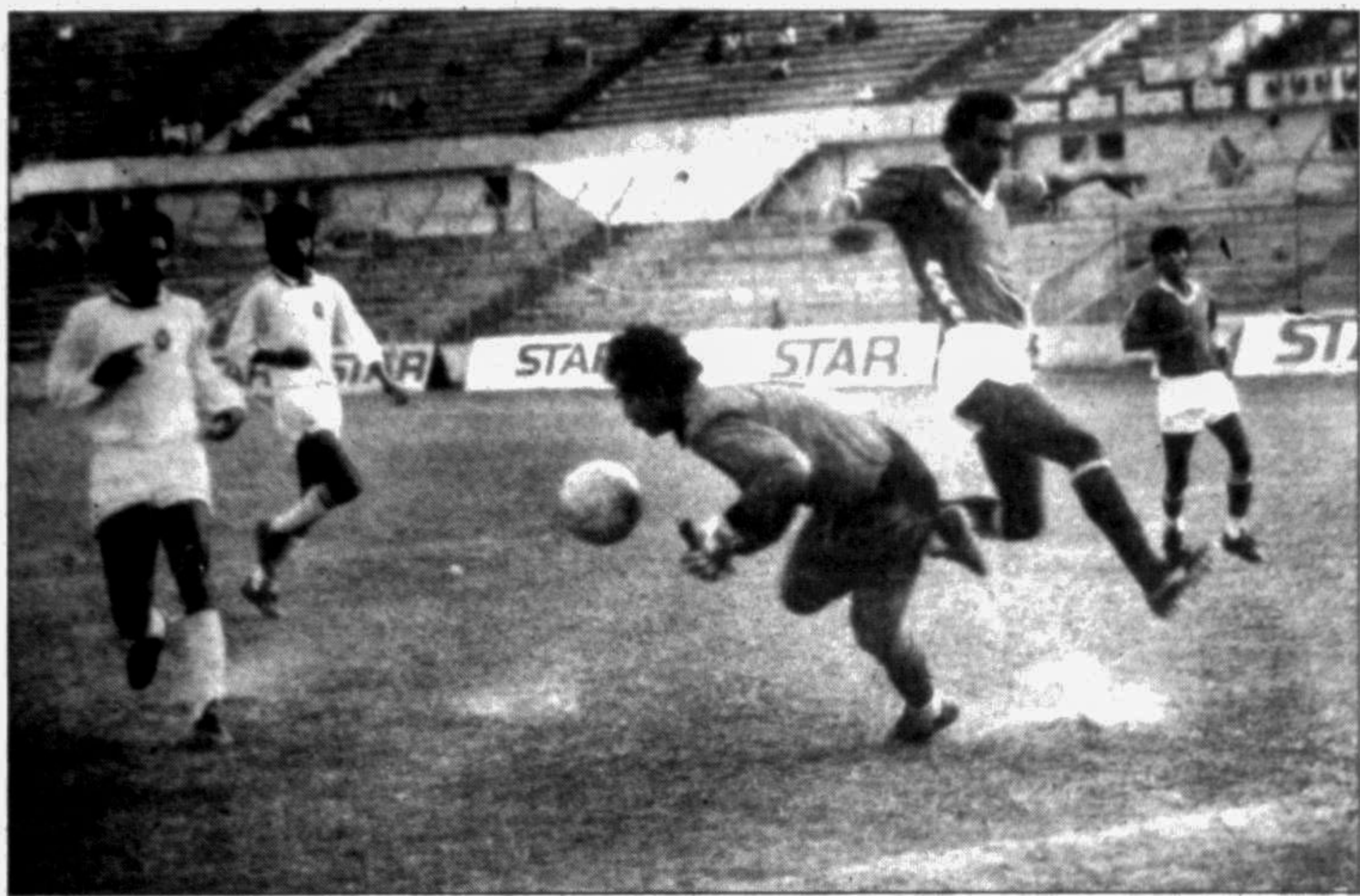
The Wari goalkeeper thwarts a Victoria forward in yesterday's first match of the First Division football league at the Dhaka Stadium. Victoria won 3-0.