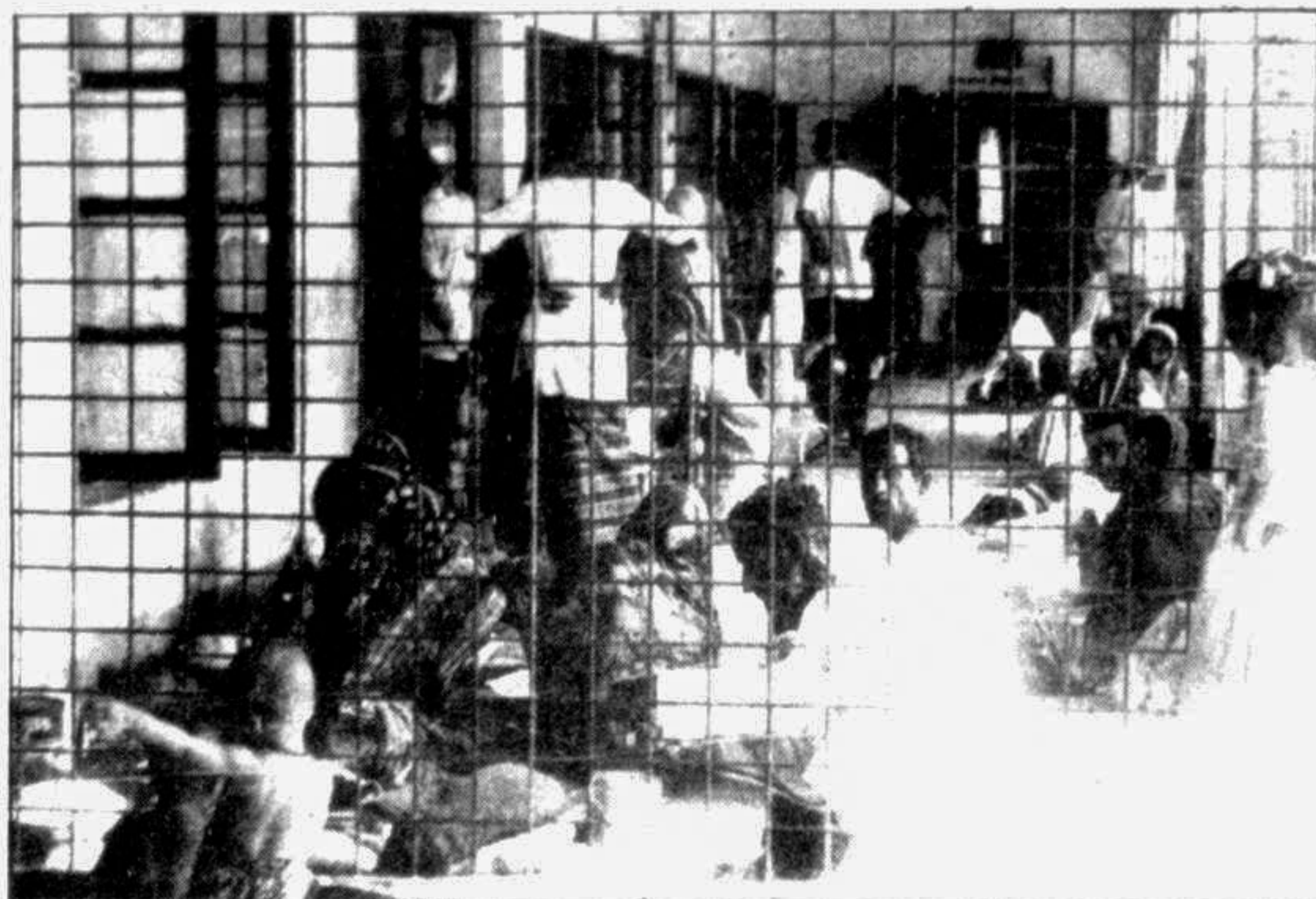
FARIDPUR: The patients have taken shelter on the floor of the verandah due to shortage of bed in local 100-bed general hospital.