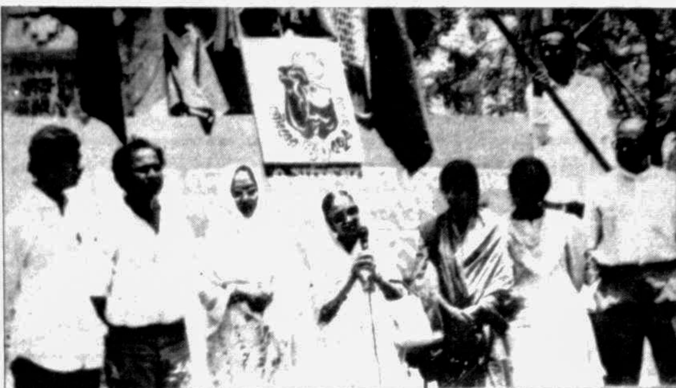
Poet Sufia Kamal addressing as chief guest the 40th founding anniversary function of Bangladesh Chhatra Union (BSU) at the Aparajeya Bangla Sunday.

$ 1.881m IDB grant for Rohingyas The Islamic Development Bank (IDB) has approved a grant of 1.881 million dollars for Myanmar Muslim refugees in Bangladesh, official sources said here Saturday, reports BSS. The approval was given at a meeting of the Board of Executive Directors of the bank held on April 21. The grant will be utilised for the construction of camps for the refugees and for providing other urgent facilities such as tubewells, trench latrines and mobile medical services trucks. Besides, the IDB had contacted a number of relief organisations and other interested organisations in Saudi Arabia such as Islamic International Relief Agency, Jeddah and Rabeta Al-Alam Al Islami Makka Al Mokarram to mobilise more help for the refugees. The bank will coordinate with these organisations and cooperate with them to maximise the help for the Myanmar Muslim refugees in Bangladesh.