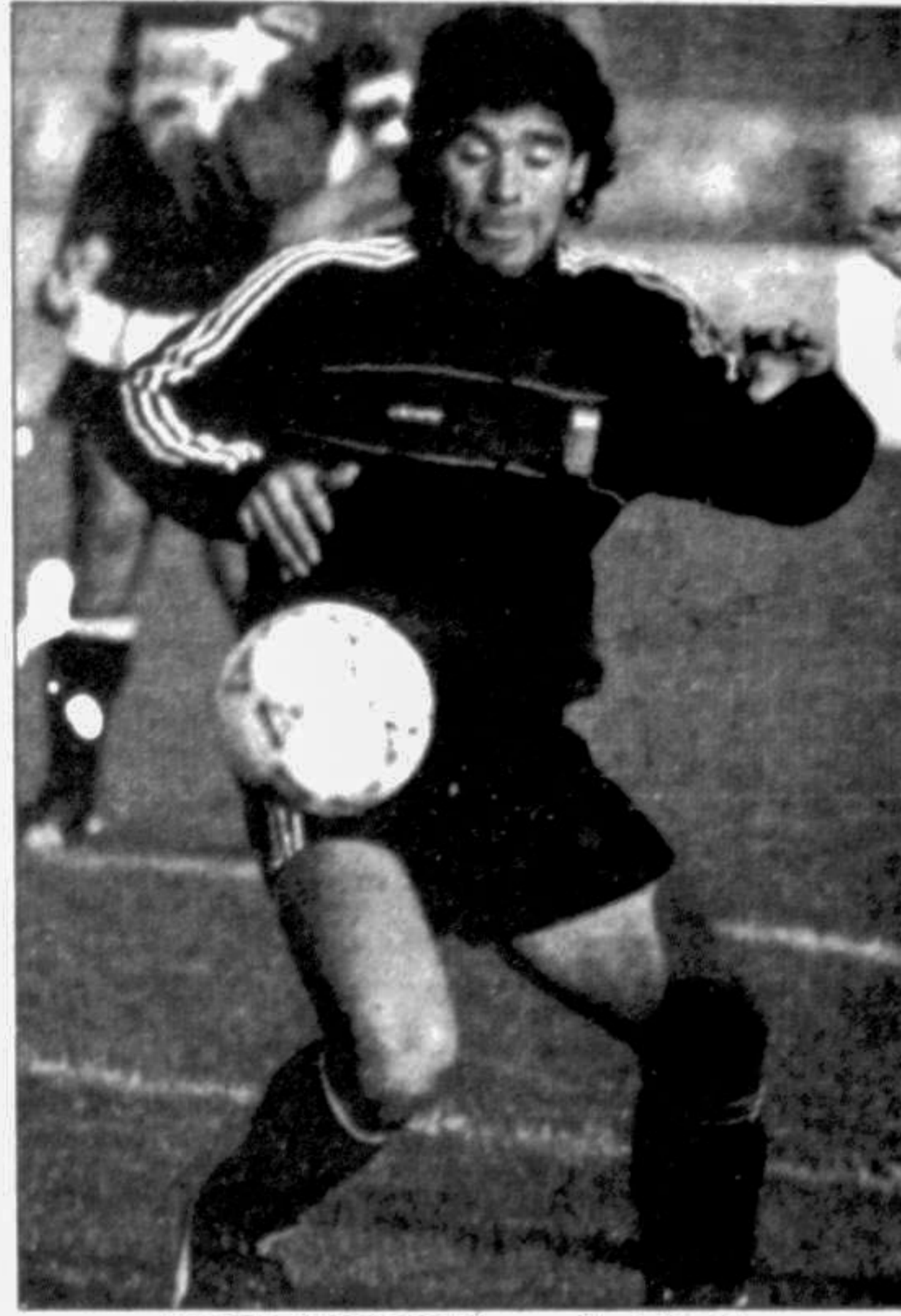
DIEGO MARADONA...moral vindication

Rules apart, FIFA evidently wanted to avoid a highly publicised confrontation with a player still revered by many. Maradona was named the most valuable player for leading Argentina to the 1986 World Cup title and then took them to the final in 1990, when it