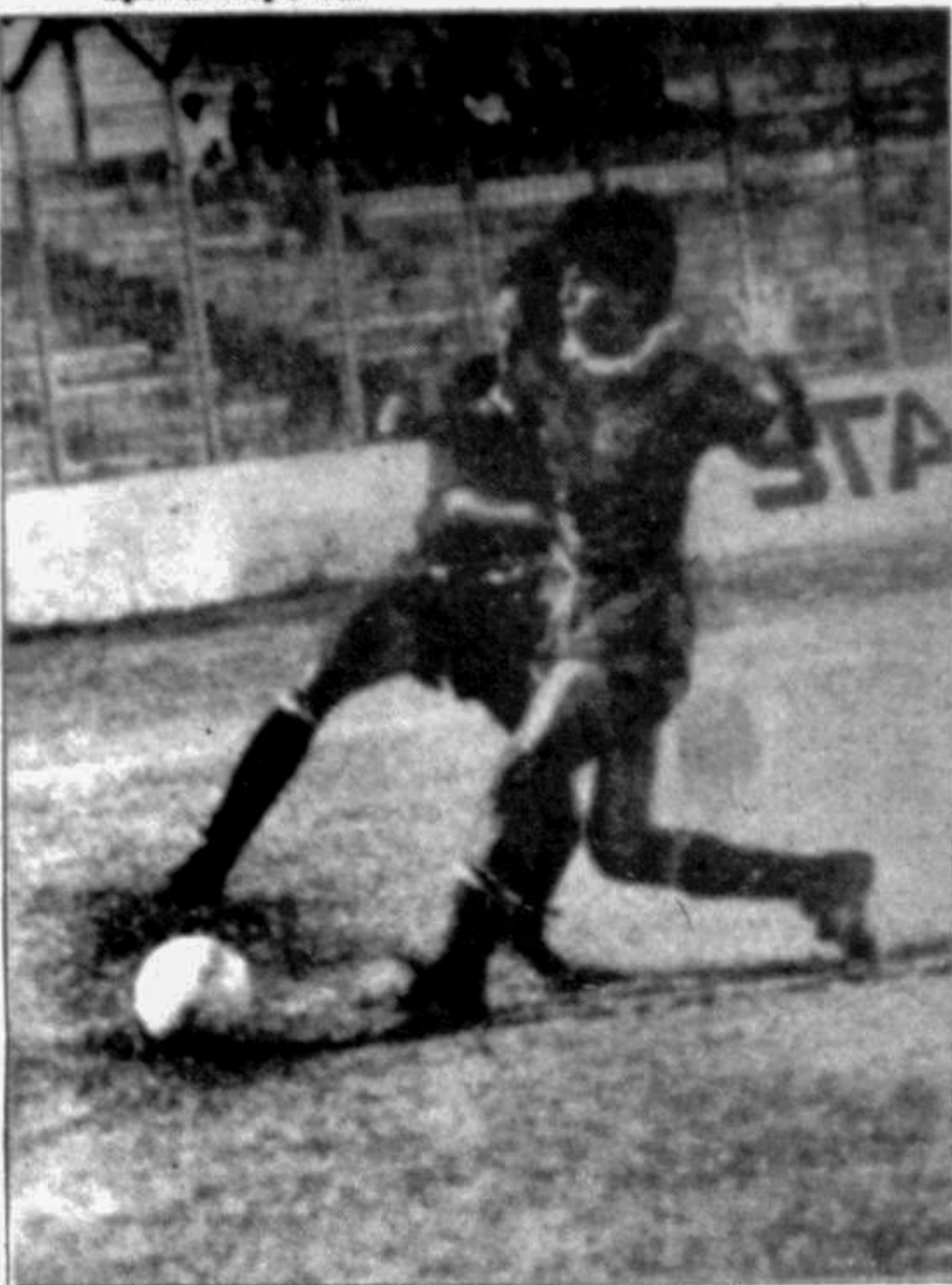
Action from yesterday's drawn First Division football league encounter between Adamjee and Police at the Dhaka Stadium.

set back and were rewarded with the equaliser four minutes before the final whistle when striker Khokan scored from close to ensure an invaluable point for his side. Adamjee's collection rose to 13 after 15 matches while