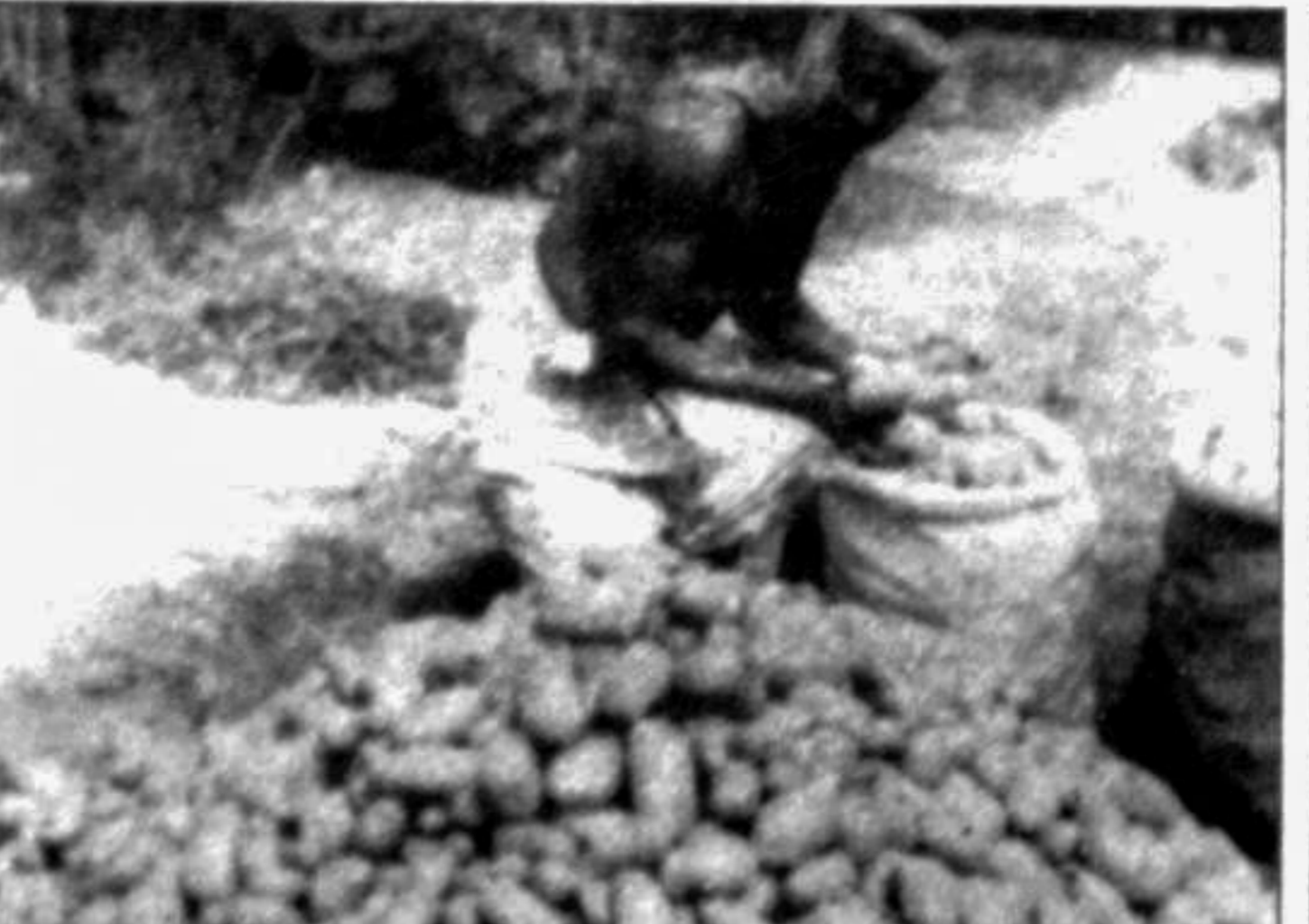
SIRAJGANJ: The farmer, Abdul Latif (30) of village Boirabari in Belkuchi upazila produced 125 maunds of potato in each bigha of land during the current season. The upazila authority has awarded him the title of 'Ideal Farmer' and gave prizes for his achievement.

Indiscriminate destruction of trees and plants for use as firewood in the brickfields has been threatening ecological balance in the district, reports UNB. In spite of government restriction, huge quantity of wood is burnt regularly in the brickfields on the plea that coal supply is inadequate. High consumption of wood raised the price of firewood in the district by at least Taka 20 a maund. Each maund of firewood now sells at Taka 80 as against Taka 60 a few months ago.