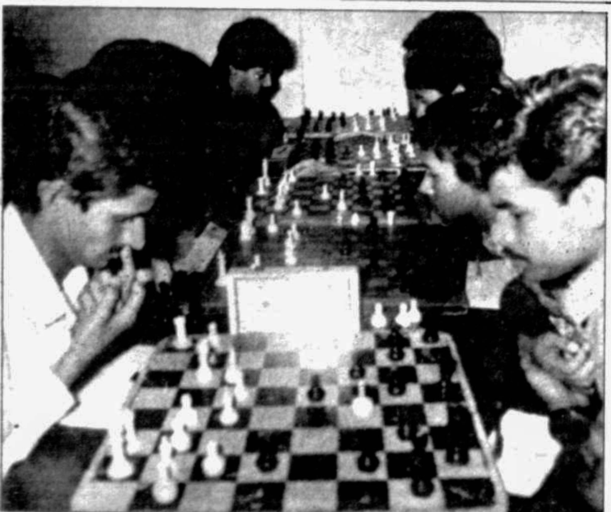
Scene from yesterday's play in the 18th national qualifying meet at the National Sports Council chess room.