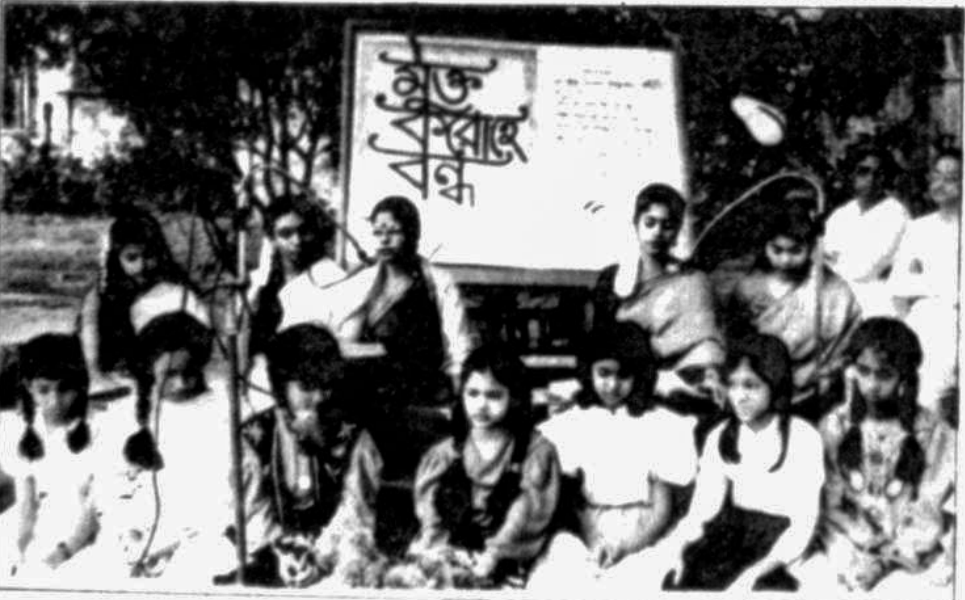
AGRI-VARSITY: The artistes of Geeti Arghya Music School rendering songs on BAU campus on the occasion of Pahela Baishakh recently.

Bangabandhu Parishad organised a seminar and a rally.