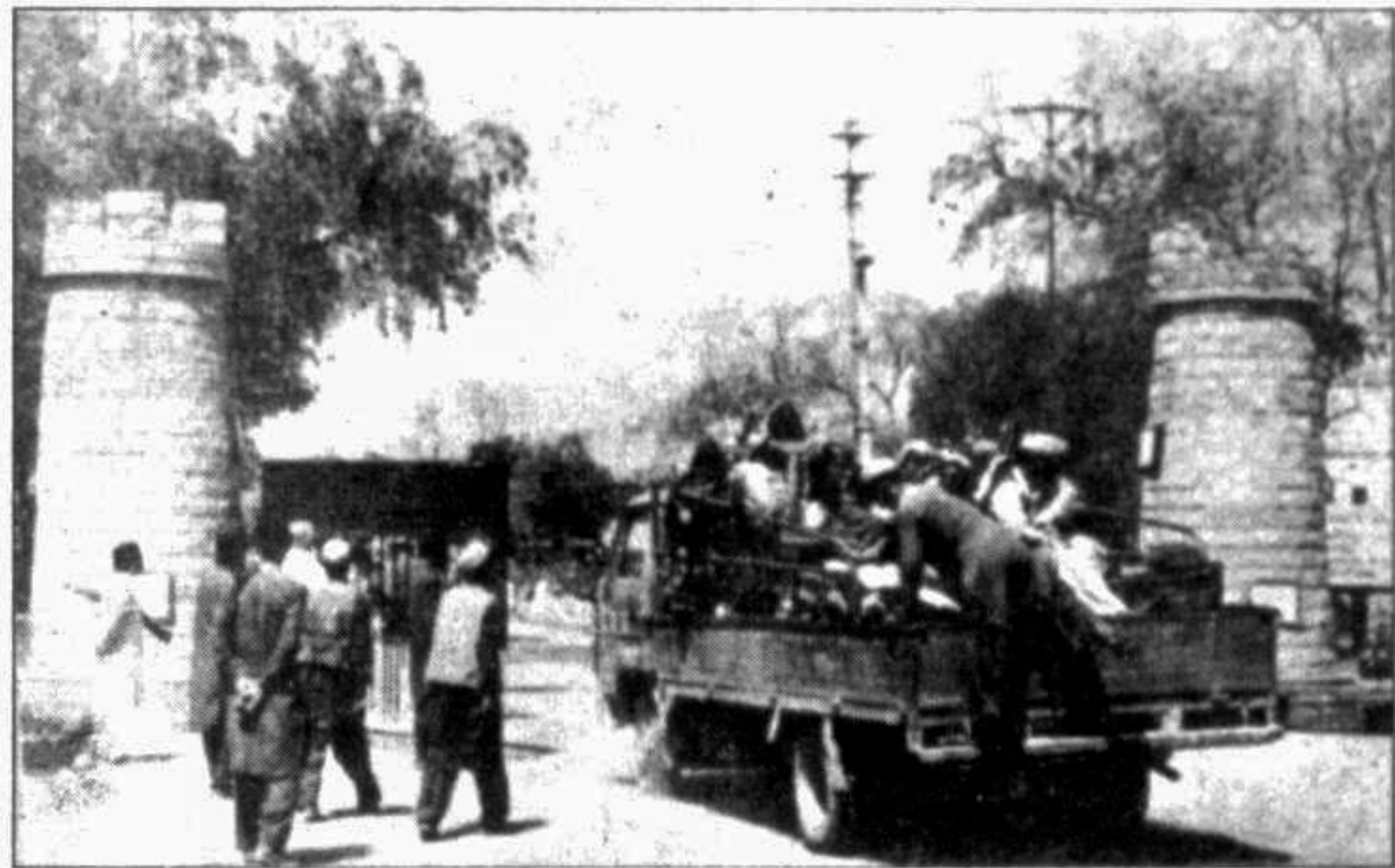
TORKHAM, Pakistan: A truckload of Afghan refugees heading back to Afghanistan, enters the last Pakistani outpost at the Pakistan-Afghanistan border town of Torkham Wednesday amid hectic peace efforts by the United Nations.