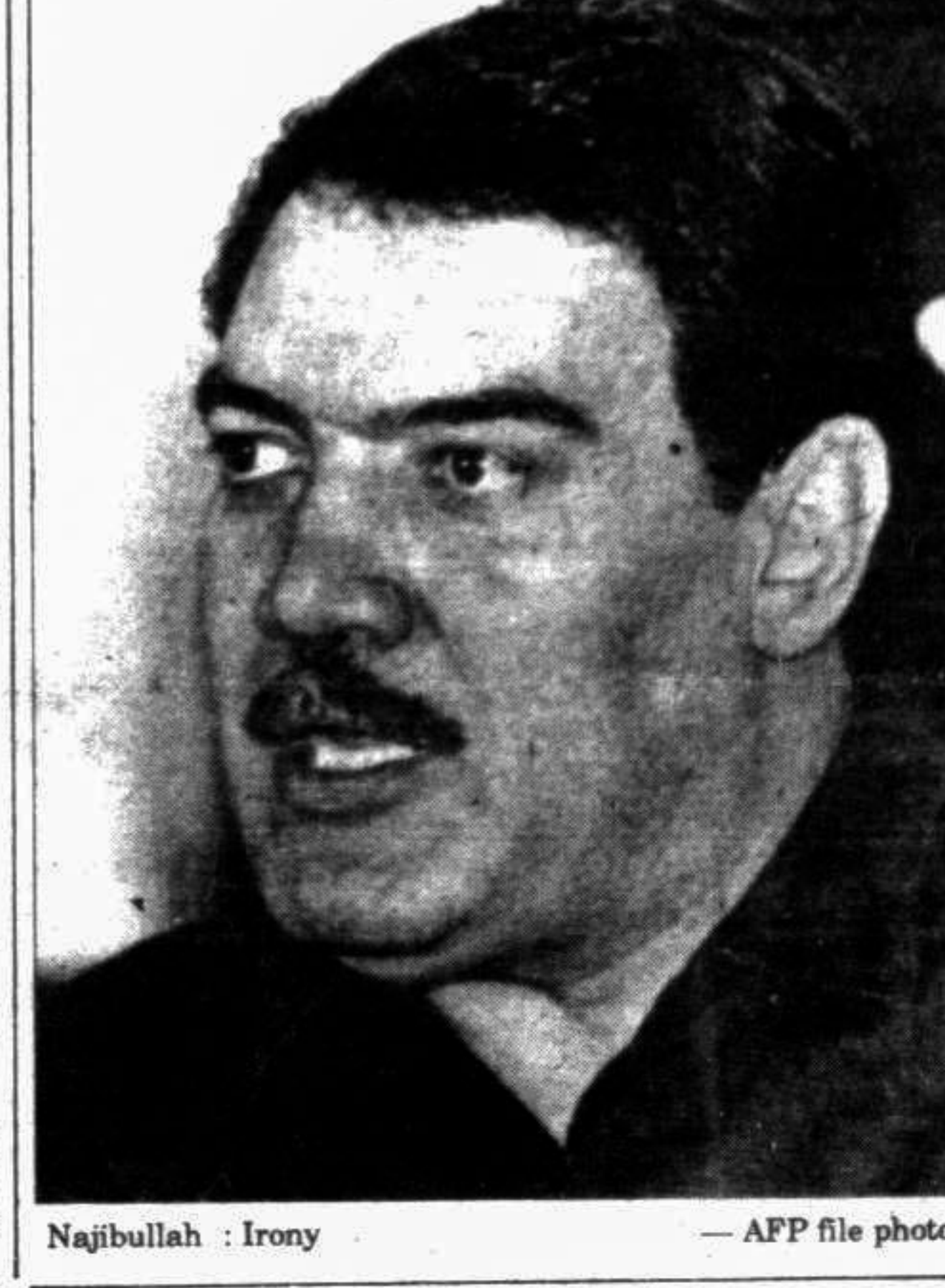
Najibullah: Irony