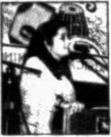
Dress Parade on a soiree Page 3