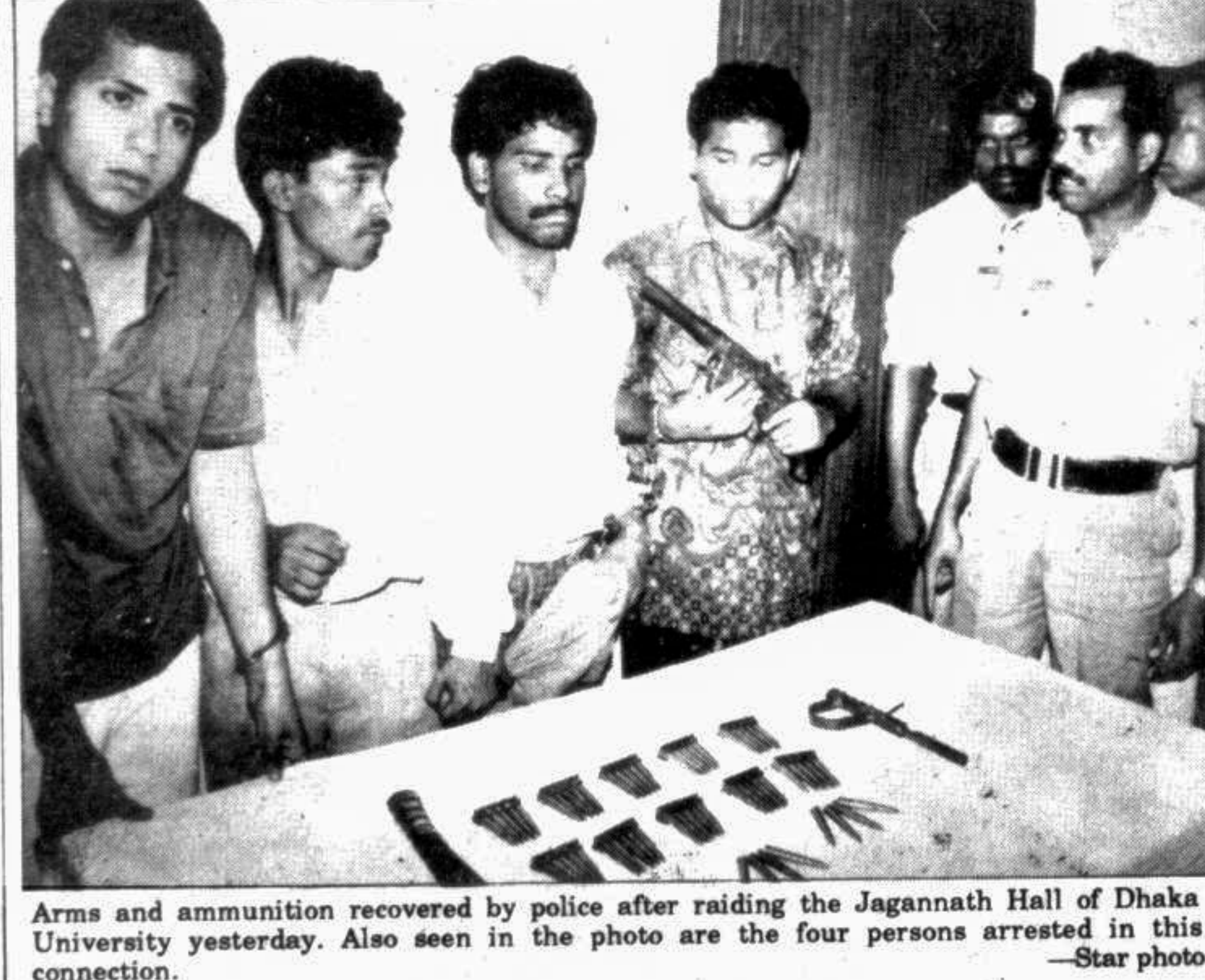
Arms and ammunition recovered by police after raiding the Jagannath Hall of Dhaka University yesterday. Also seen in the photo are the four persons arrested in this connection.