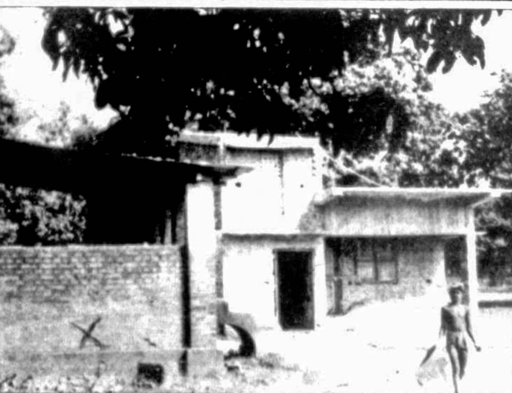
Chapanaabaganj: The open unshed room in local Santibag residential area is the morgue of the district. No step has yet been taken to shift it after repeated appeals.

Local elite said the major administrative set-back was due to absence of a regular hospital Superintendent to supervise 47 physicians, 28 nurses and 122 third and fourth class employees of the hospital.