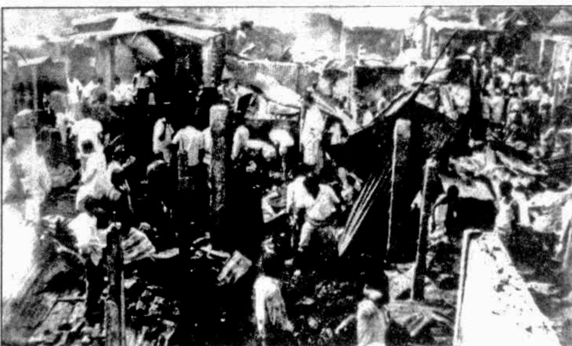
RANGPUR: The local Nababganj wholesale market where fire broke out on April 5 and gutted 360 shops. The fire originated from electric short circuit that gutted property worth Taka 50 crore.

The guardian of the girl complained that Monira was abducted from the school at gun point.