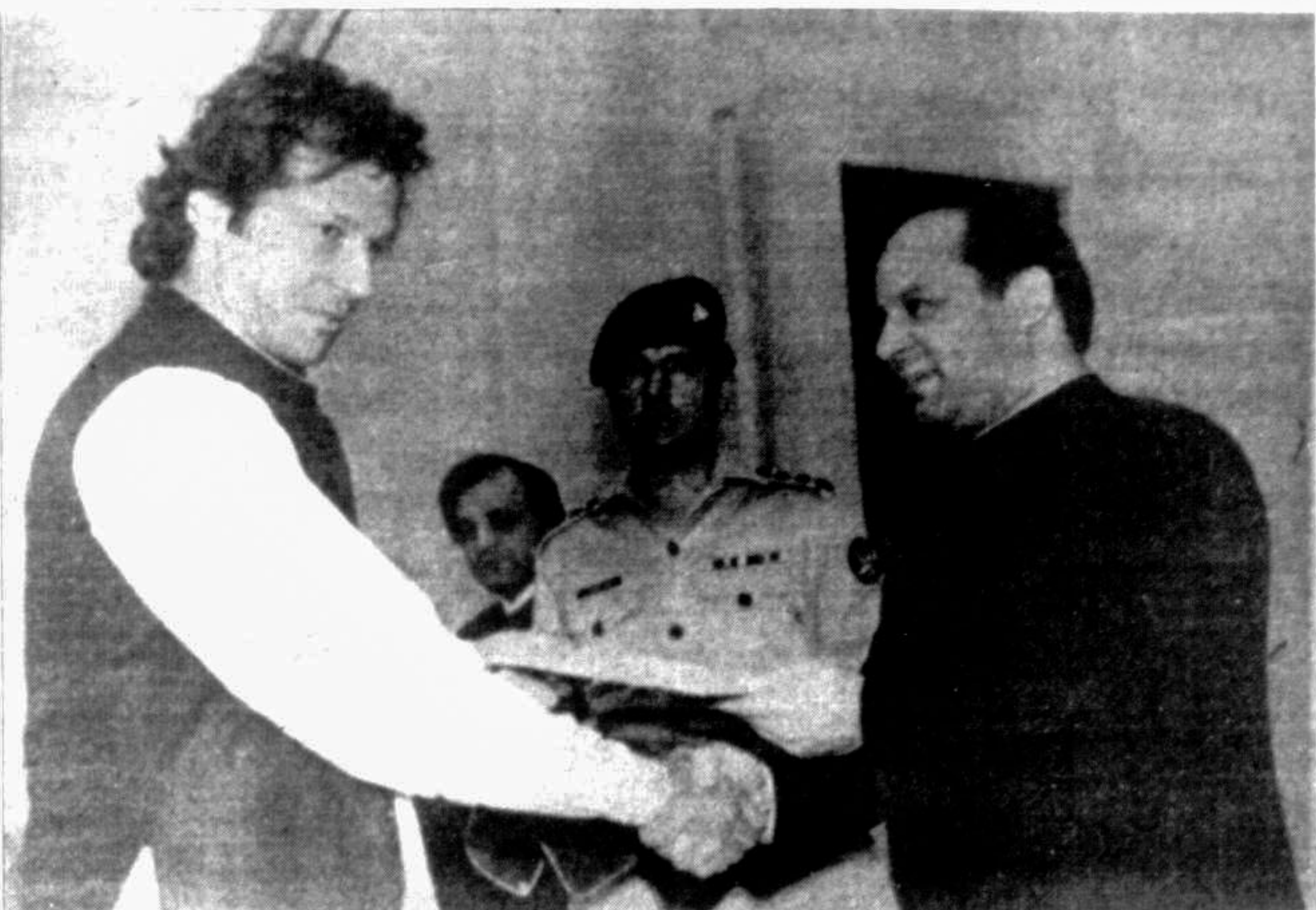
Pakistan cricket team captain Imran Khan (L) receives papers allotting him a 600 square yard residential plot of land from Pakistan Prime Minister Nawaz Sharif in Islamabad on April 11. Imran and all other members of the World Cup winning team received a plot of land and a cash prize of 8,000 dollars from the government.

Bowling: O M R W Donald 8 1 49 0 Pringle 7 0 32 0 Henry 4.5 0 41 0 Snell 6 0 30 0 Result: West Indies won by 10 wickets.