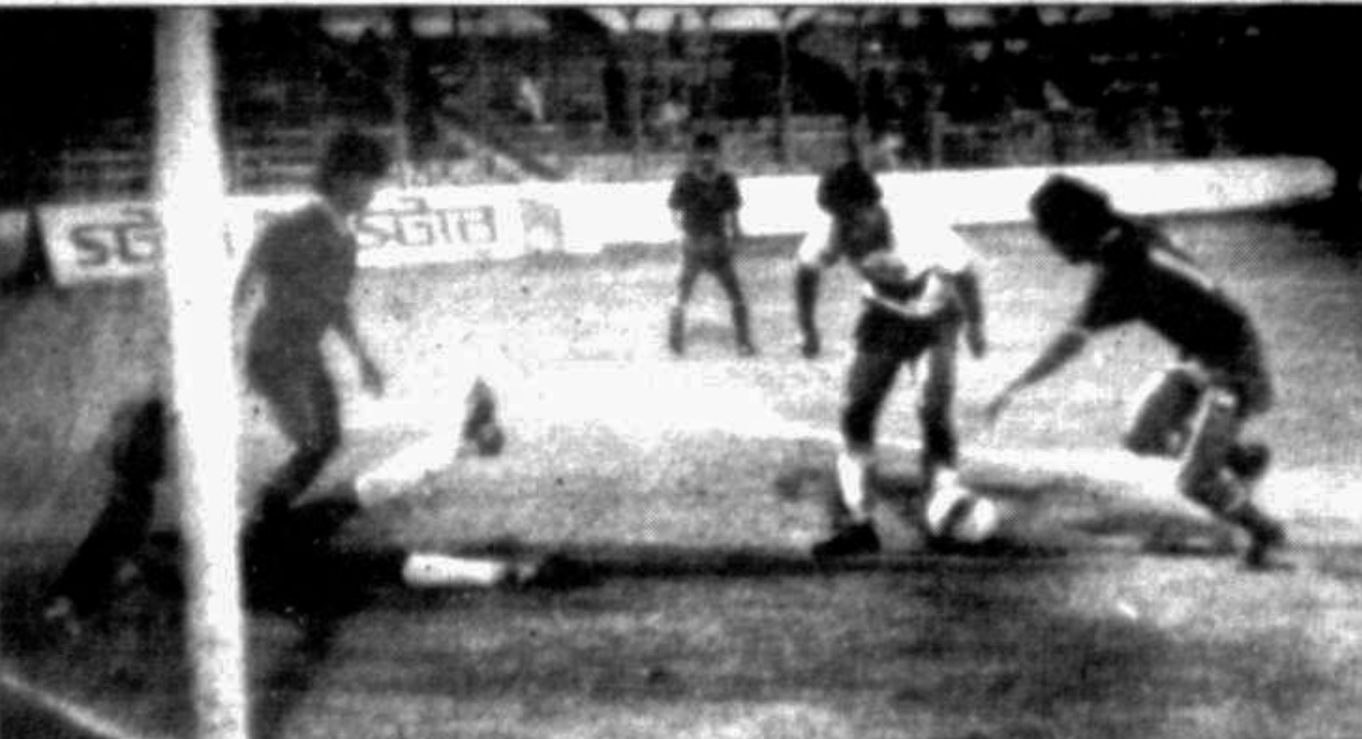
Action from yesterday evening's First Division football league match between Arambagh KS and Adamjee SSC at the Dhaka Stadium. The teams drew 1-1.