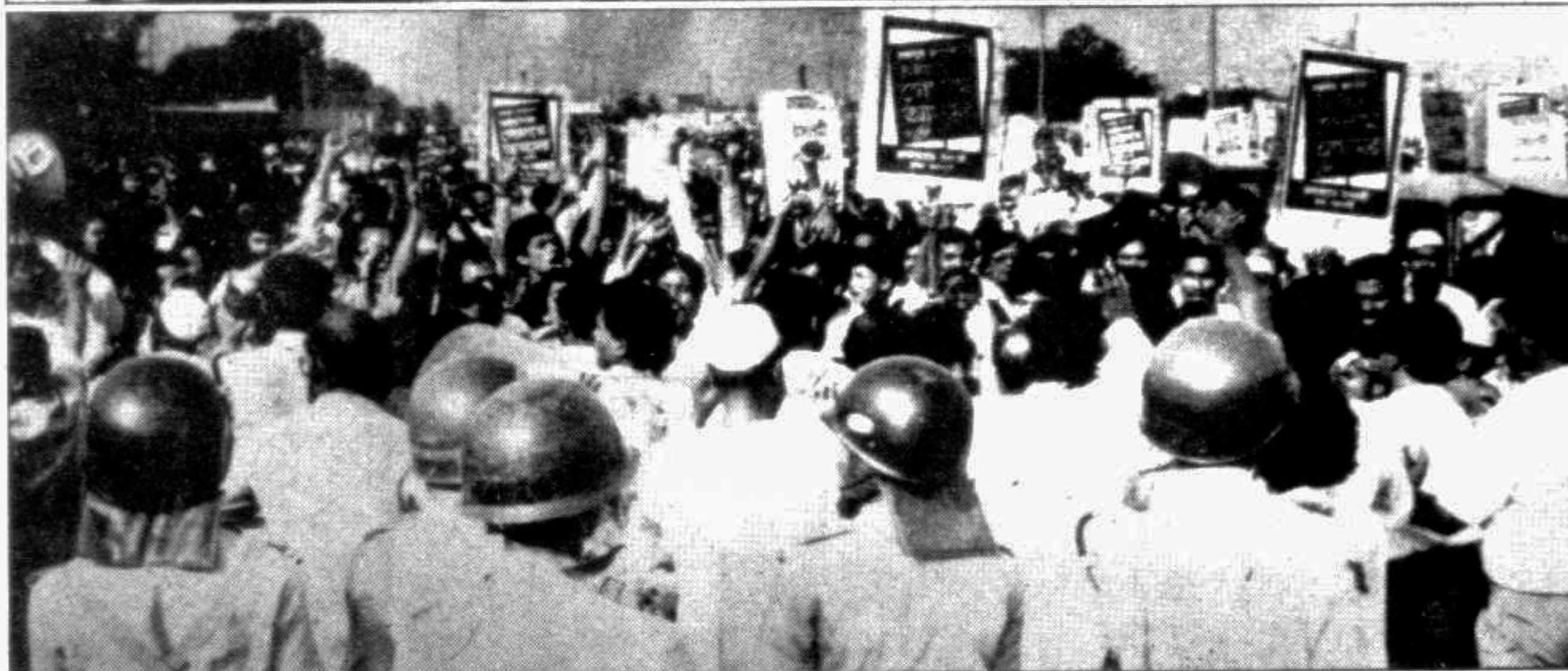
OFFLIMITS: Police blocked JS-bound processions of trial body near Bangla Motor (top) and of Jamaat near Sonargaon hotel yesterday (above).