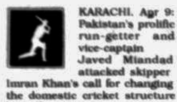
KARACHI, Apr 9: Pakistan's prolific run-getter and vice-captain Javed Miandad attacked skipper Imran Khan's call for changing the domestic cricket structure here Thursday, reports AFP.

Speaking to reporters, Miandad, 35, who made his Test debut in 1975, said "Imran's call to change the format of domestic cricket is based on a lack of knowledge of domestic cricket as he hasn't played it since the early '80s."