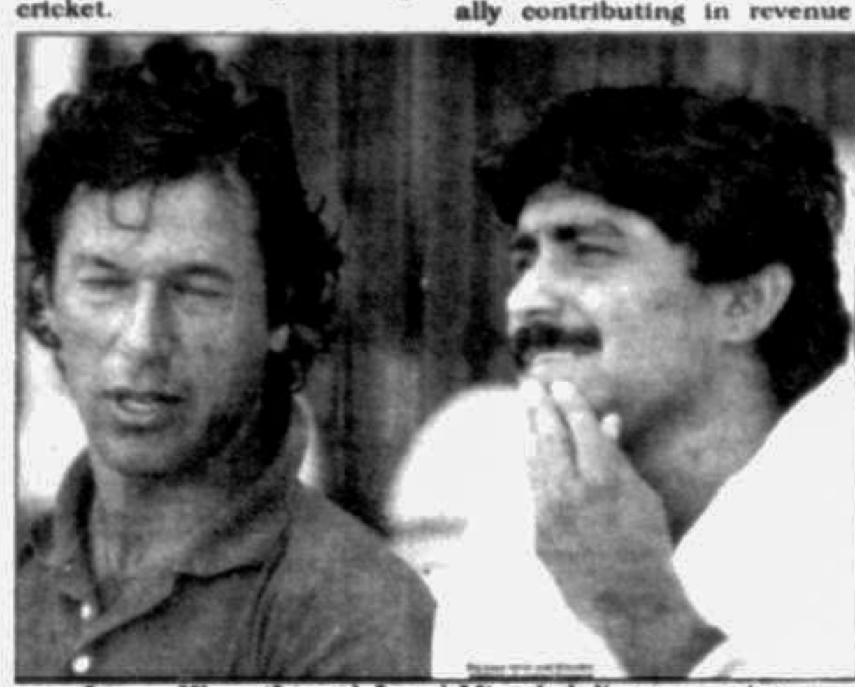
Imran Khan (L) and Javed Miandad discuss a point.

Speaking to reporters, Miandad, 35, who made his Test debut in 1975, said "Imran's call to change the format of domestic cricket is based on a lack of knowledge of domestic cricket as he hasn't played it since the early '80s."