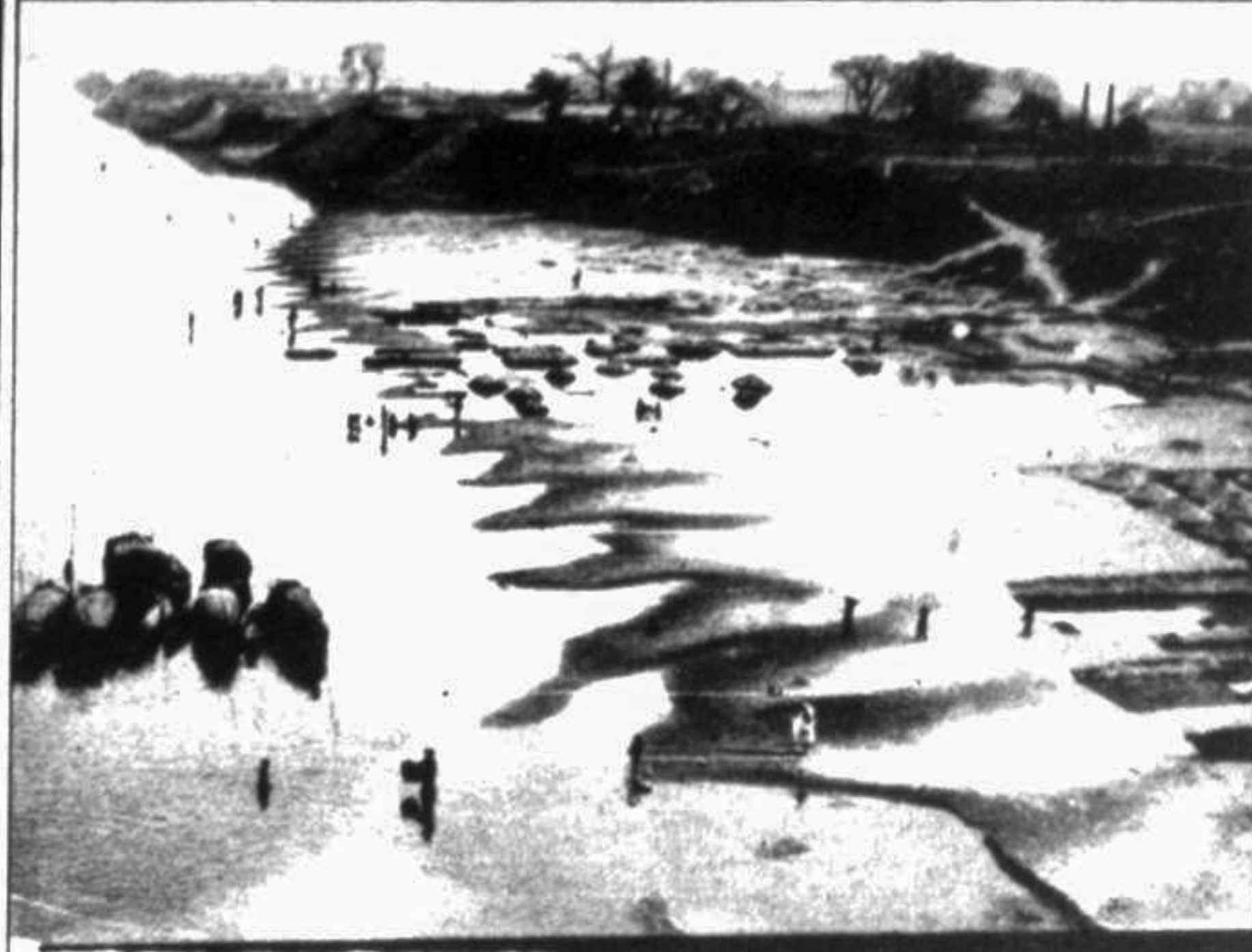
SYLHET: The river Surma is going to be blocked by the silt day by day.

Apr 8: A security guard of Amu Tea Garden of Chunarughat upazila in the district was allegedly killed by some unknown garden labourers, reports UNB.