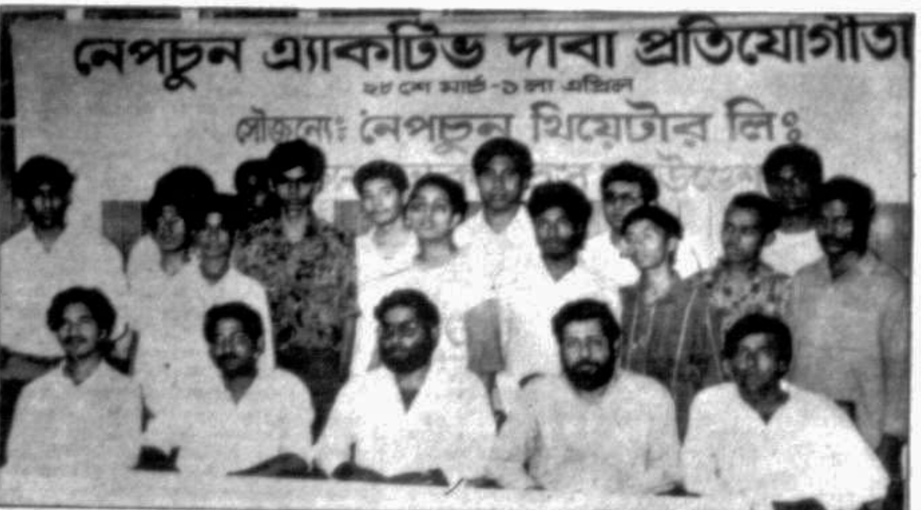
Participants of the Neptune active chess tournament seen with the guests at yesterday evening's awards ceremony at the NSC.

Arab Bangladesh Bank Ltd is expected to sponsor the meet.