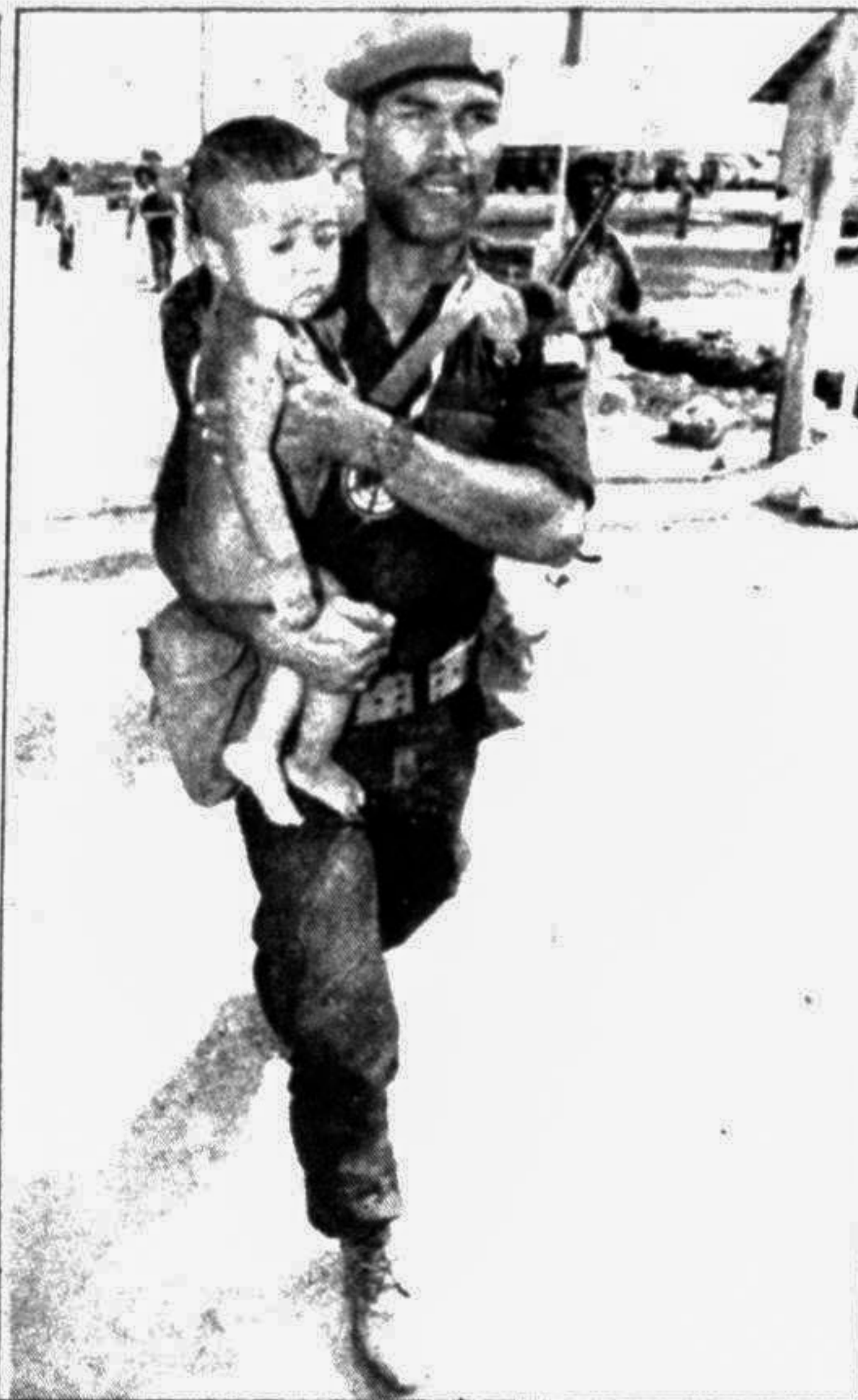
A Malaysian soldier, deployed as part of UNTAC, carries a repatriated Cambodian refugee child upon arrival at the resettlement camp at Sisophon yesterday.

Witnesses said the truck knocked them from behind while going to well number one of the gasfield at noon.