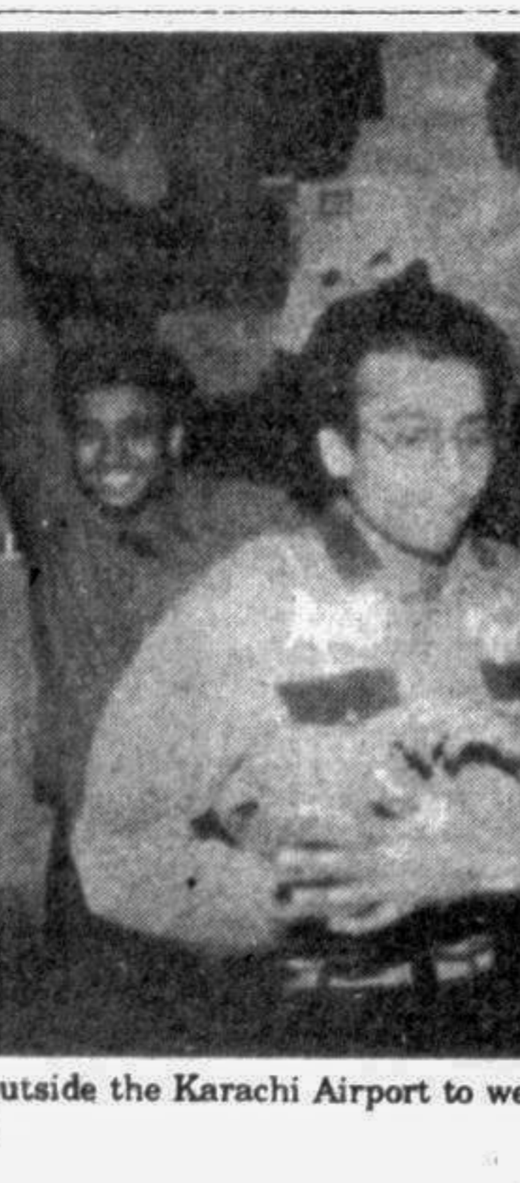
Pakistani cricket fans dance outside the Karachi Airport to welcome the victorious World Cup cricket team on March 29.

Cricket chairman Brian Close said on Friday: "We won't