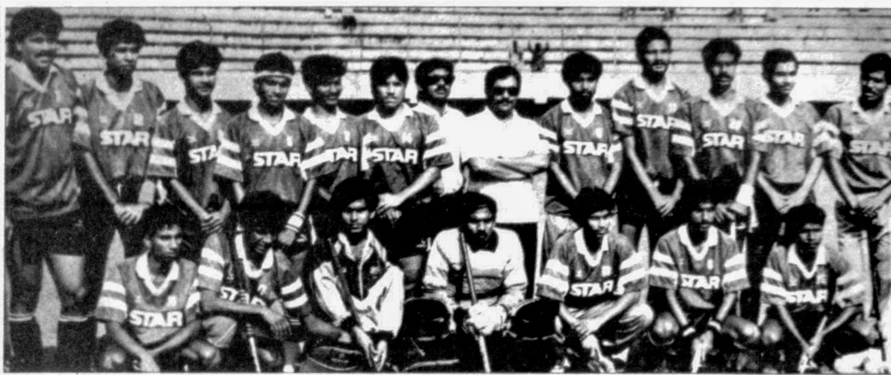
The Dhaka Mohammedan Sporting Club team which yesterday became the unbeaten champions in the 1992 Green Delta First Division hockey league beating arch-rivals Abahani 3-1 in the last and title-deciding match at the Hockey Stadium.