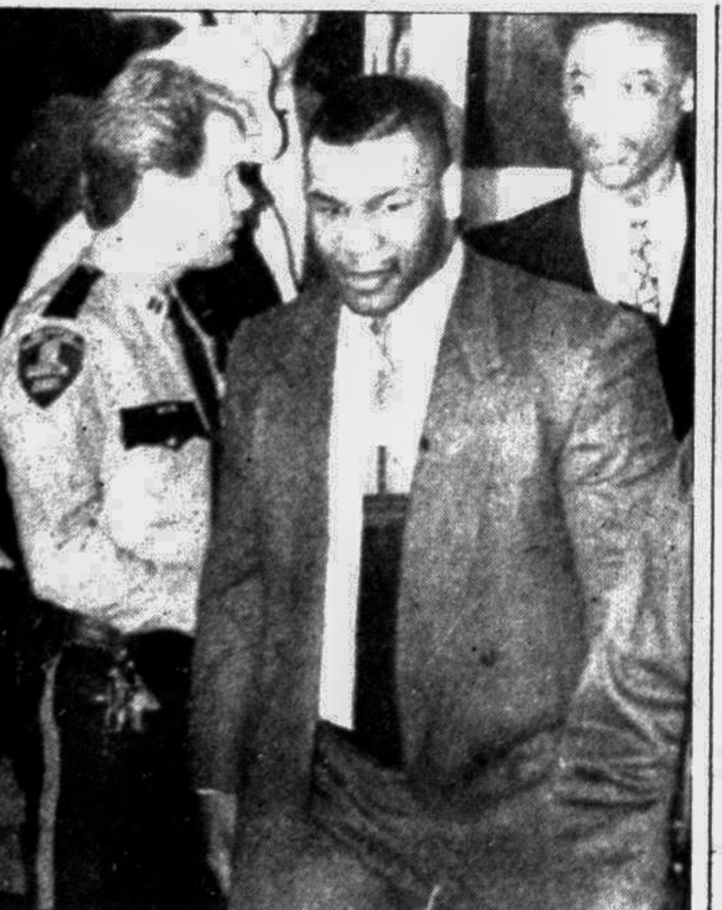
Former heavyweight champion Mike Tyson walking into the courthouse for sentencing in Indianapolis on March 26. Tyson was found guilty of raping a beauty queen and was sentenced to six years in prison.