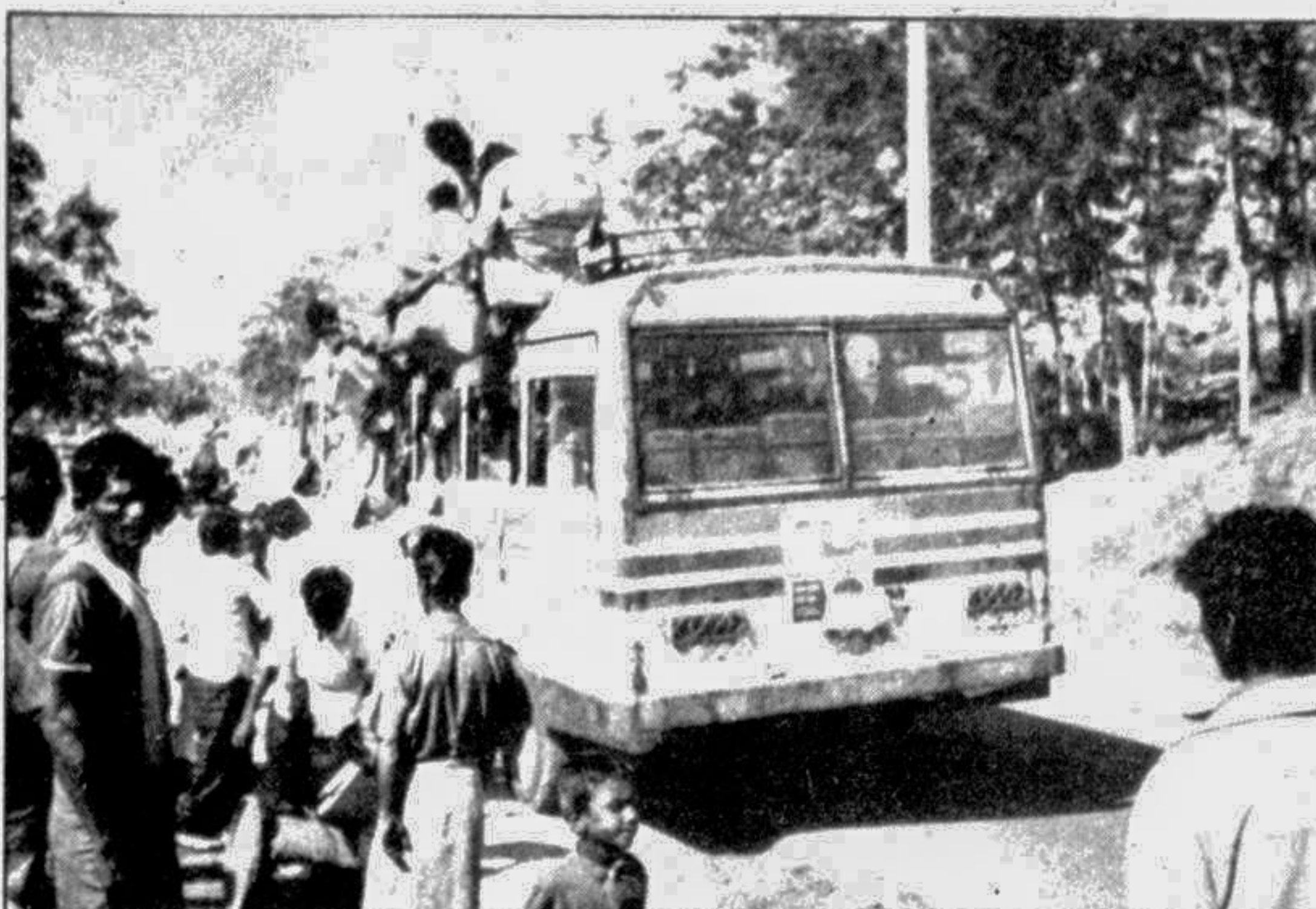
COX'S BAZAR : The influx of Myanmar refugees still continues. The refugees are coming from Teknaf border to take shelter at Dhechupalong refugee camp.

Mar 24: Two people allegedly committed suicide in a day in Salikha upazila of the district last week, reports UNB.