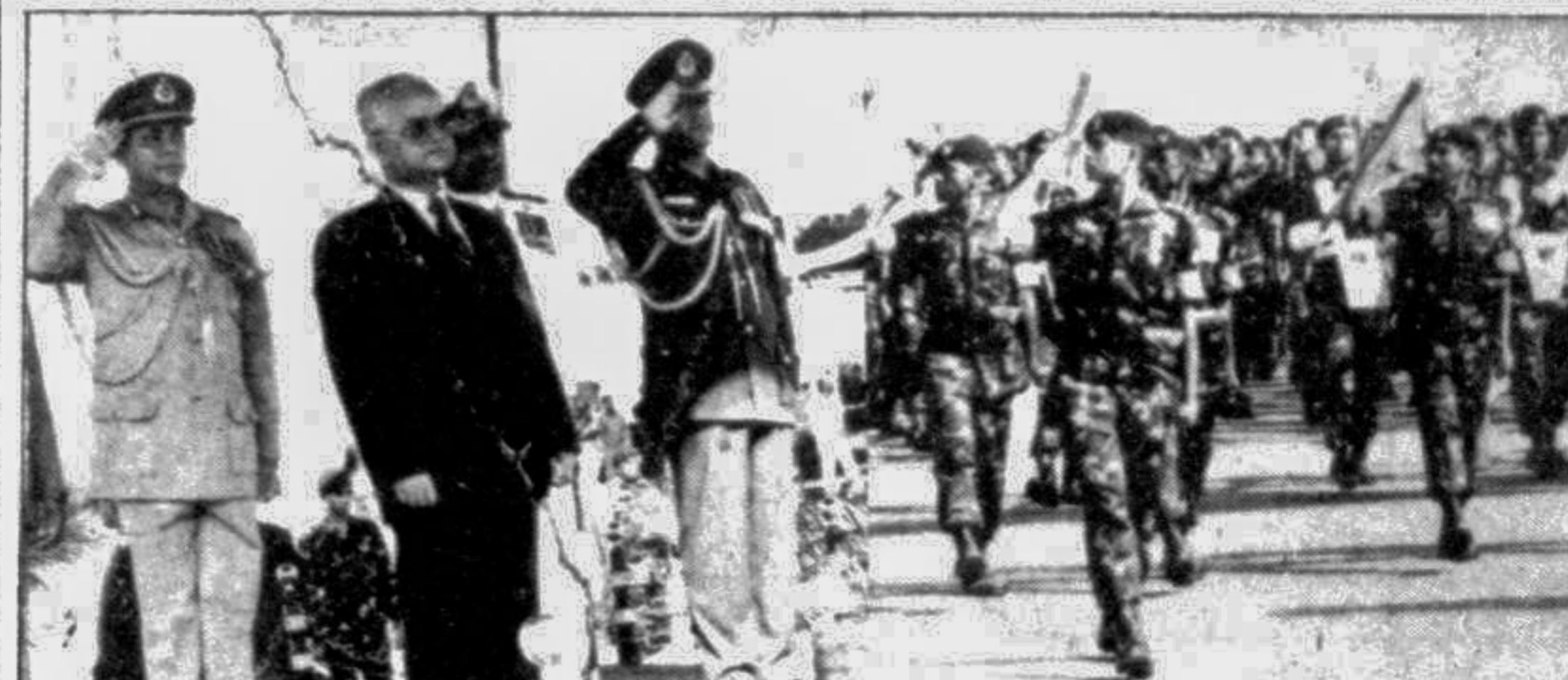
President Abdur Rahman Biswas taking salute at the Independence Day Parade Thursday.