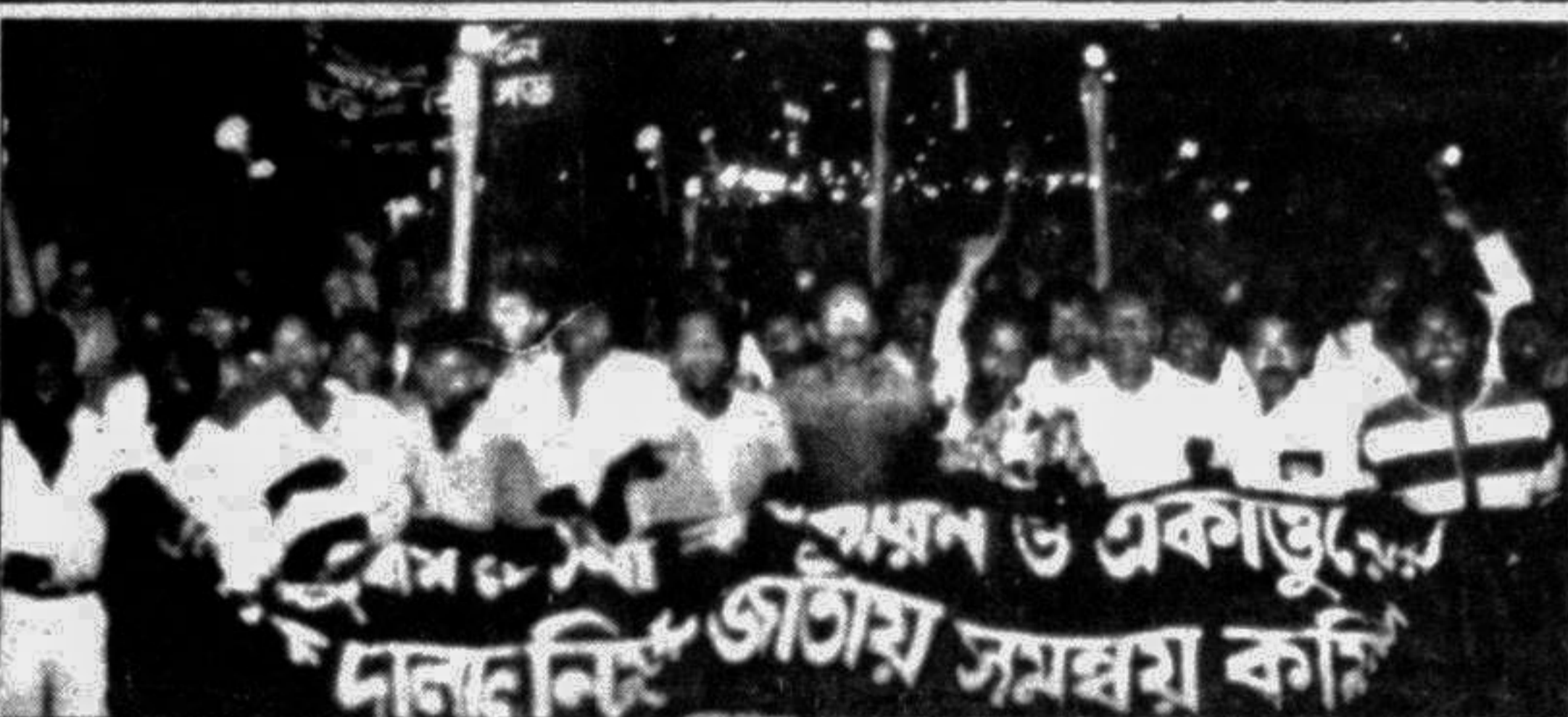
A torch procession was brought out in the city yesterday by the activists of Ekattorer Ghatok O Dalal Nirmul Committee.