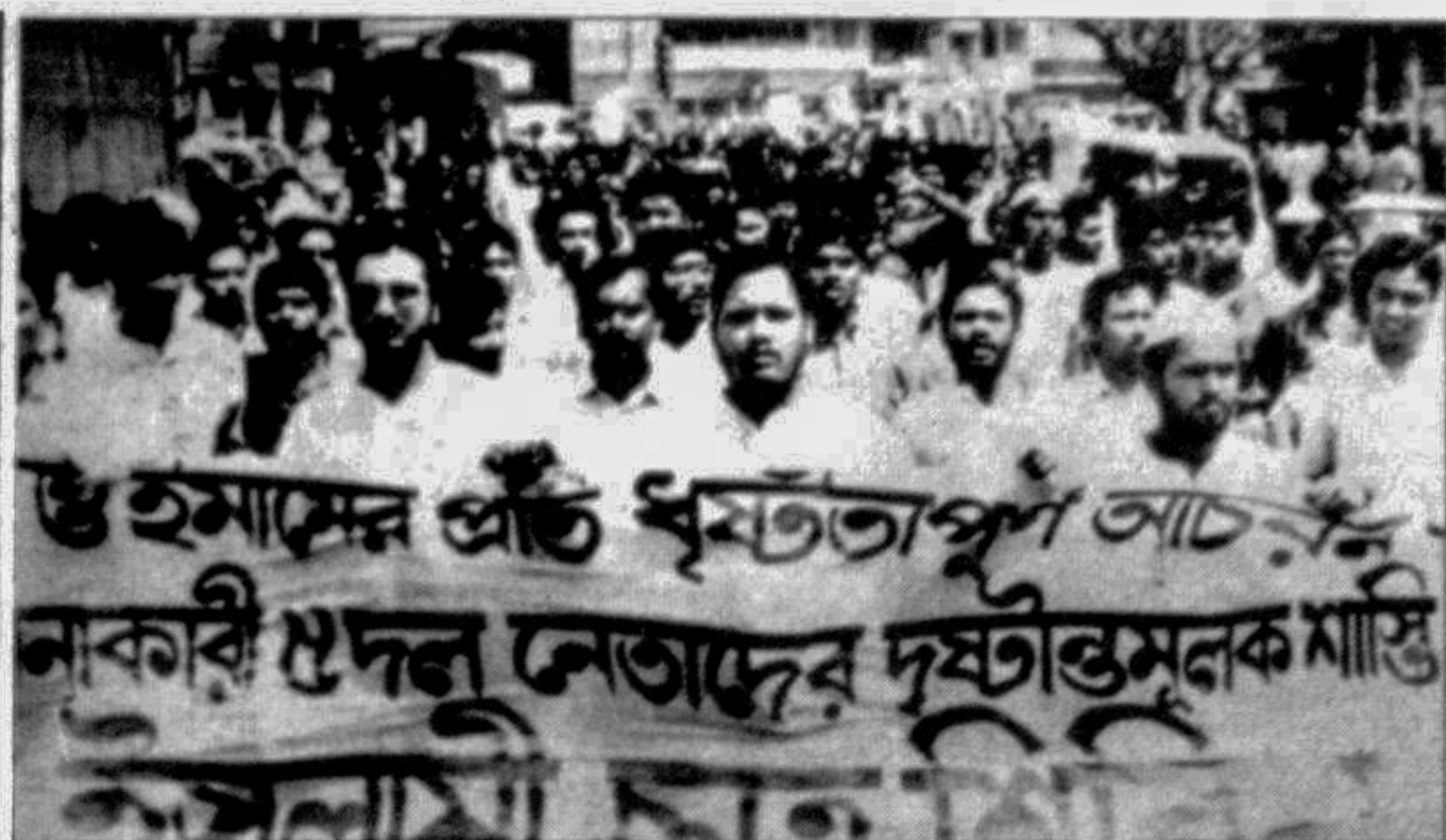
Islami Chhatra Shibir brought out a procession Monday protesting the comments made by the leaders of Five Party against Khatib of Baitul Mukarram Mosque.