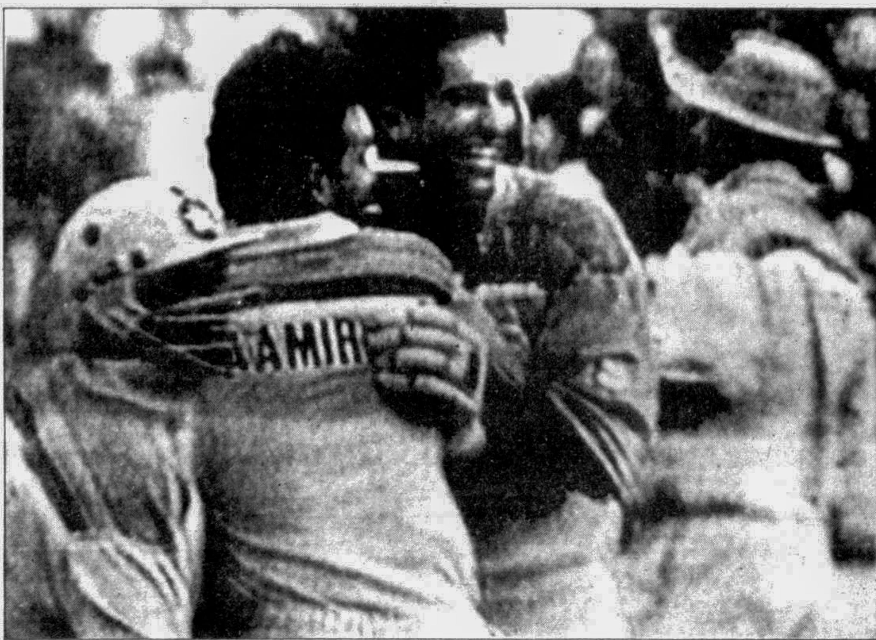
An ecstatic Waseem Akram hugs team mate Aamir Sohail after the memorable victory against New Zealand in the World Cup semifinal yesterday at Eden Park, New Zealand.

Umpires: Brian Aldridge (New Zealand), Steve Randell (Australia).