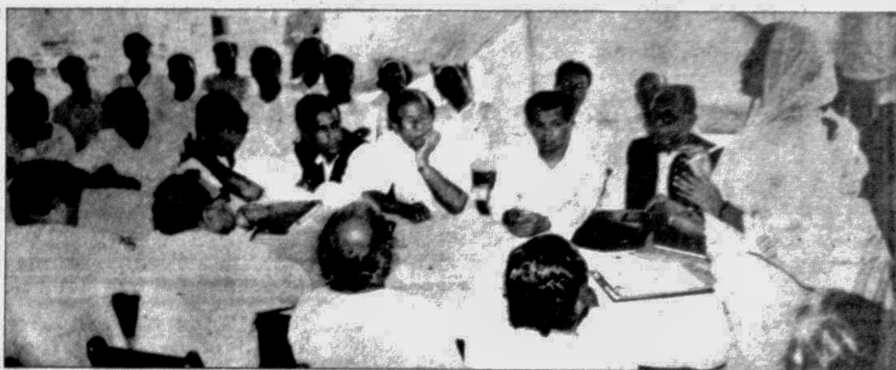
Awami League Chief Sheikh Hasina discussing with leaders of the Sammita Sramik Karmachari Oikyajote at her Minto Road residence Thursday.