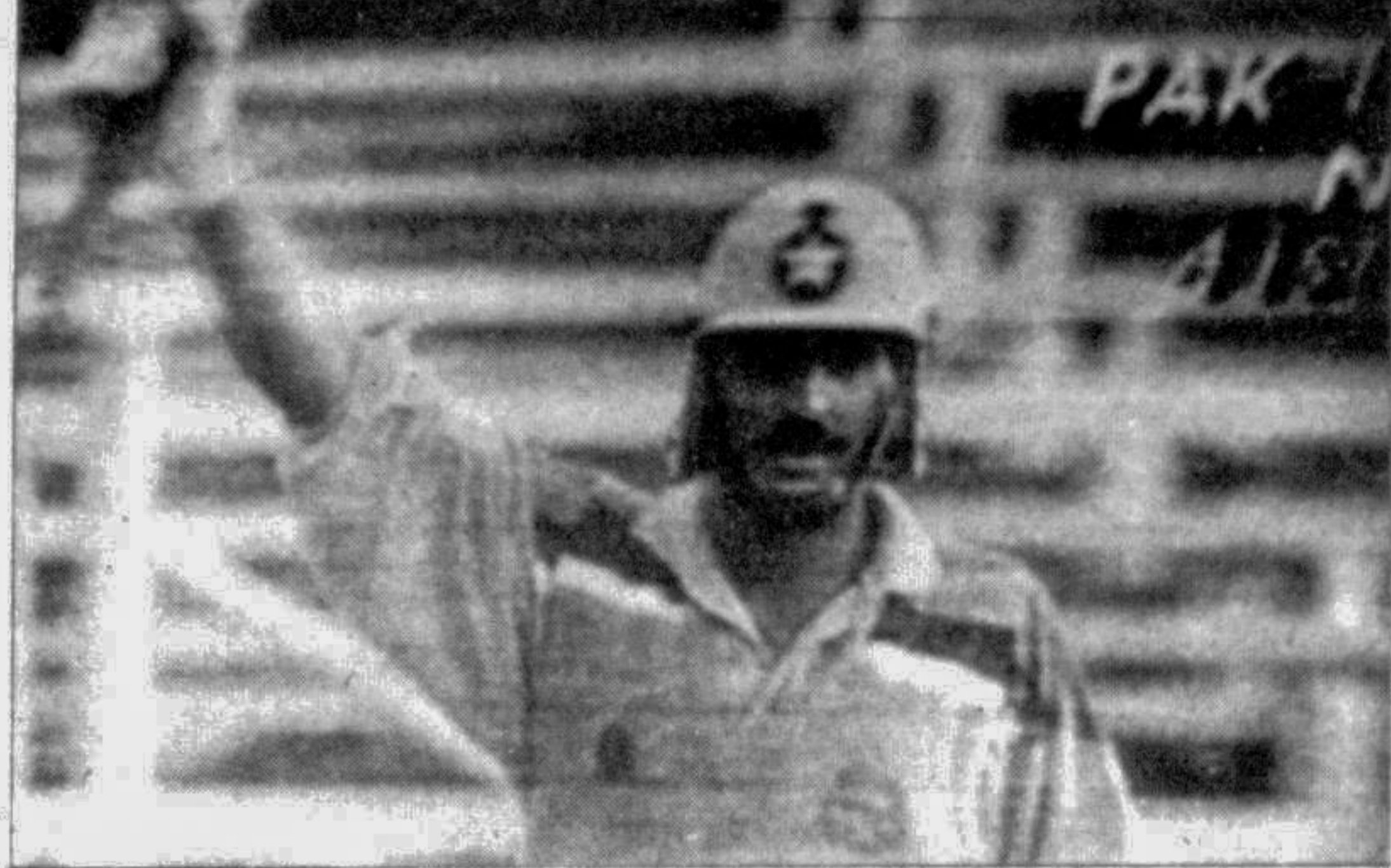
Pakistan opener Rameez Raja acknowledges the applause after reaching his second century of the World Cup yesterday at Christchurch. Rameez scored an unbeaten 119.