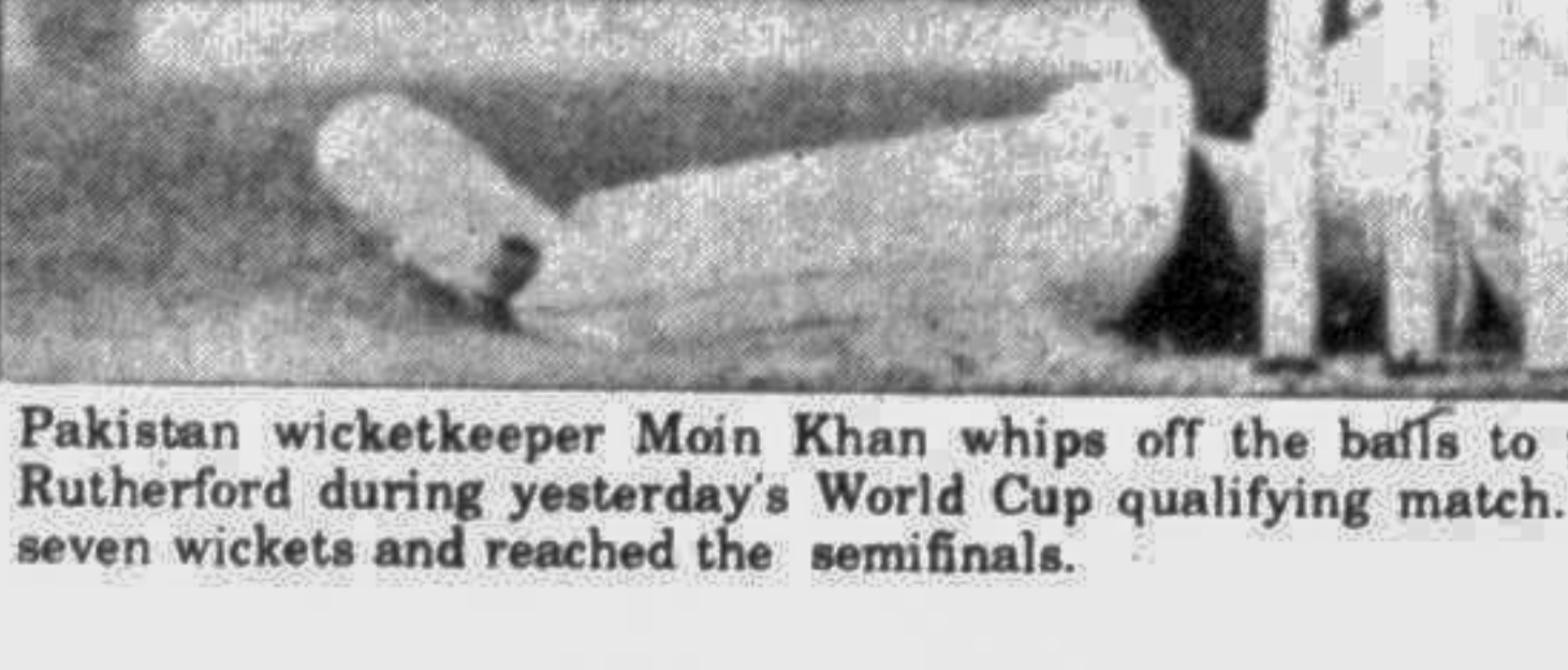
Pakistan wicketkeeper Moin Khan whips off the balls to run out New Zealand's Ken Rutherford during yesterday's World Cup qualifying match. Pakistan won the match by seven wickets and reached the semifinals.

Ganaktuli Kishore Football Eleven and Kishore Eleven will clash in the final.